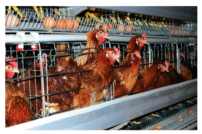
Vocational Certificate Course in Poultry Farming

NIOS offers vocational education courses at school level keeping in view the need of target groups. Presently 103 courses are on offer in the broad