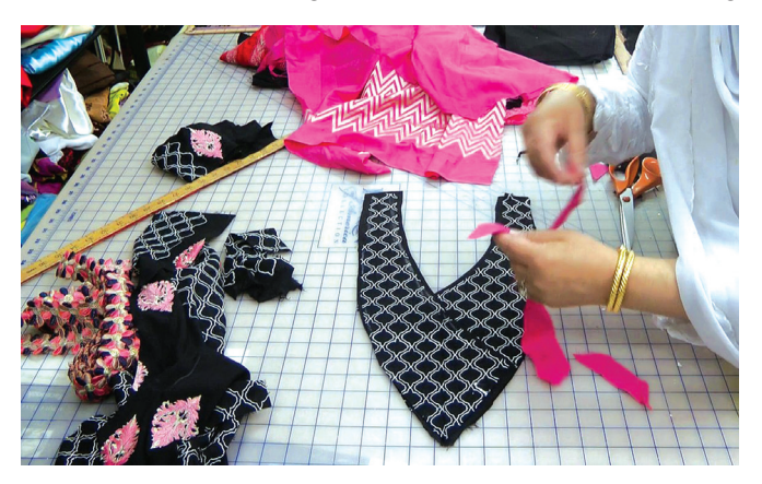
Dress Making in action

Your AVI/SAIED will organize required number of Personal Contact Programmes and Practical Training