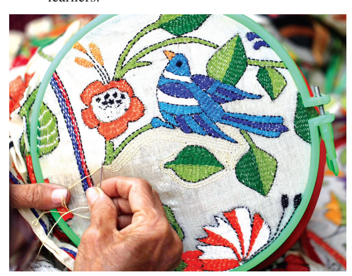
Certificate Course in Embroidery

NIOS provides education up to pre-degree level to those who for one reason or the other could not or did not make use of the formal education system. NIOS offers the undermentioned courses to meet the needs and requirements of such group of learners.