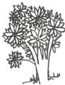
Bur flower tree