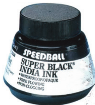
Fig. 4.4: Ink

It is already mentioned in the previous chapters that there were changes in traditional folk and tribal painting material and method due to the development of industry and urbanisation. These changes happened due to the changes in the needs and demands of the consumers. These paintings are not only done for rural festivals, rituals and celebrations but for earning a living. Thus these paintings should be considered products that are attractive and durable. It should be available in the market and be painted with easily available materials, simple usage and good results. These materials are replacing the traditional ones in fast pace.