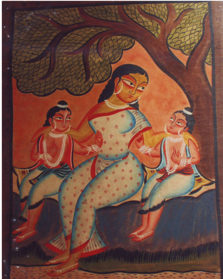
Fig. 15.4: Sita with Luv Kush