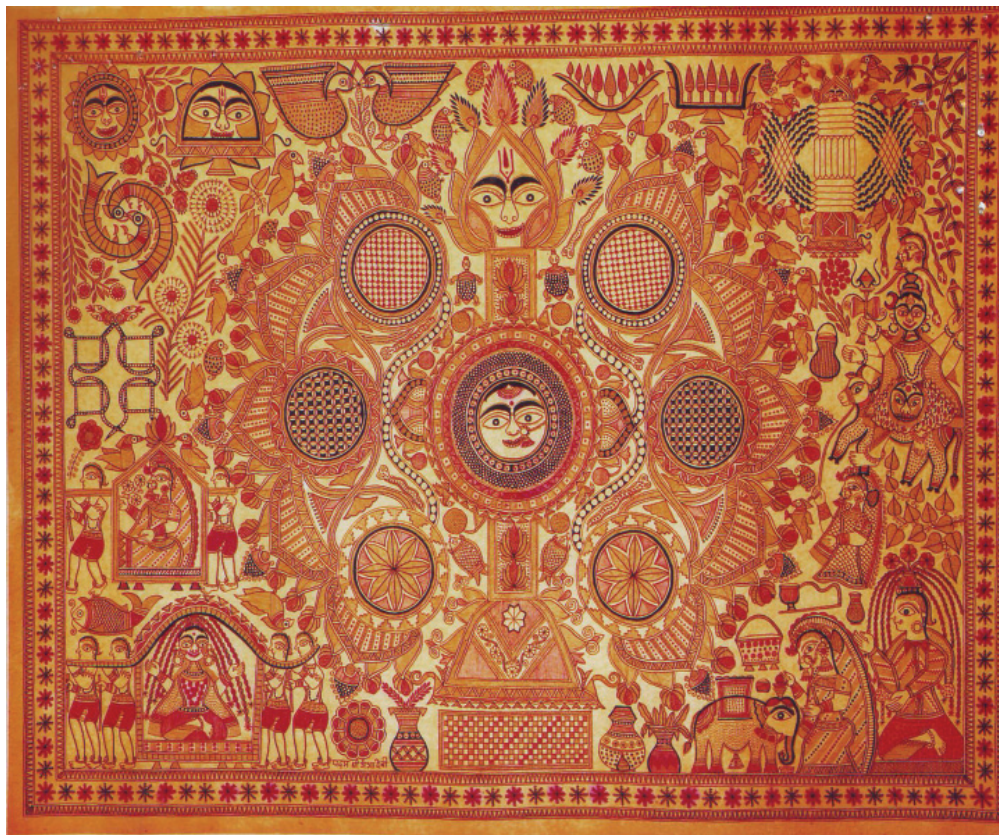
Fig. 15.3: Kohbar Ghar

Madhubani paintings are also called Mithila paintings. This genre of painting originated in the Mahdubani district of the Mithila region in Bihar. Traditionally, the paintings were made by women on the mud wall of the Kohbar (bridal