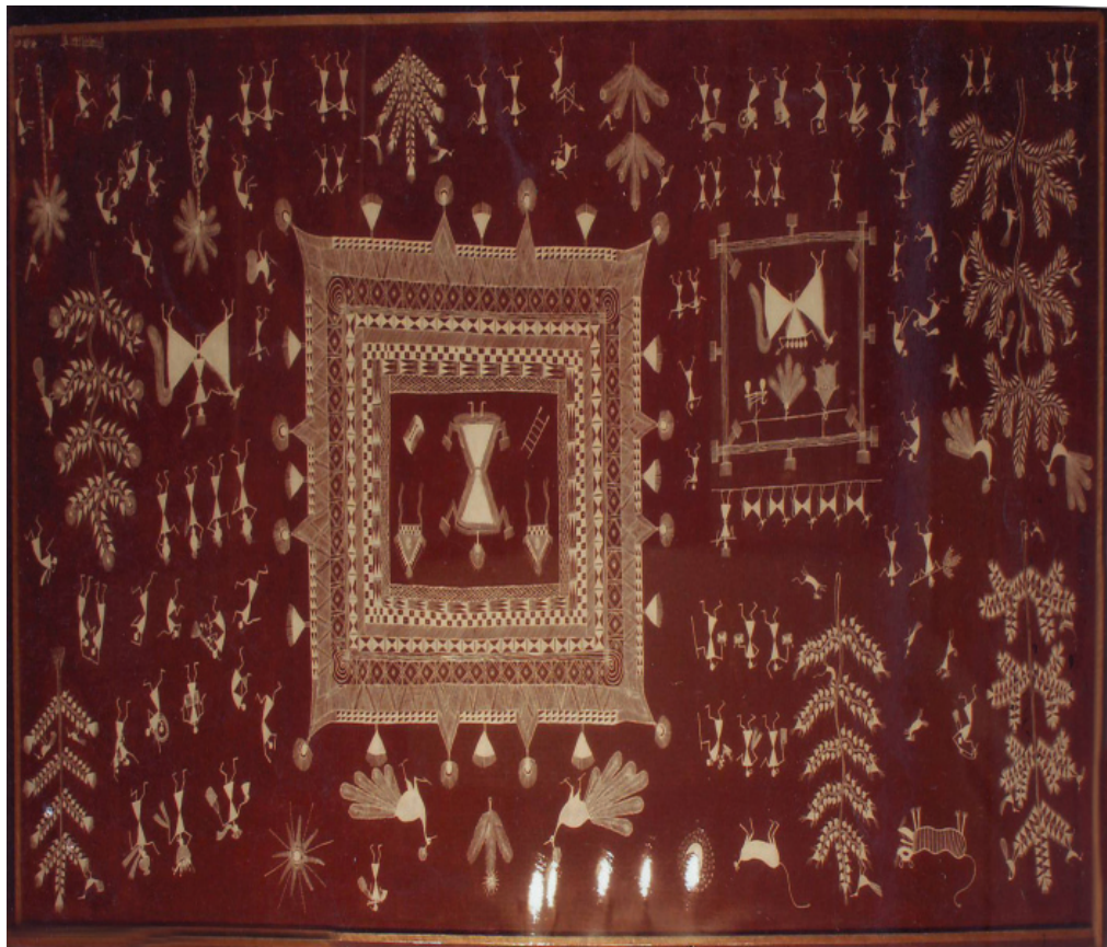
Fig. 15.1: Palghat Devi Chauk

Made by the Warli people of Dahanu and Javhar areas of the Thane district of Maharashtra to celebrate harvest and weddings, this tribal Indian art form is known