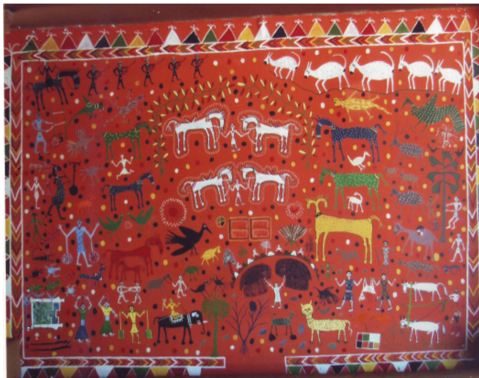
Fig. 15.2: Pithora Painting

The Bheel and Bhilala communities of Jhabua district of Madhya Pradesh and the Rathwas of the Vadodra area of Gujarat have a long, rich tradition of Pithora painting. Since these paintings are executed to appease the local deity Pithora, they are known as Pithora paintings. The style and colour combination of the painting