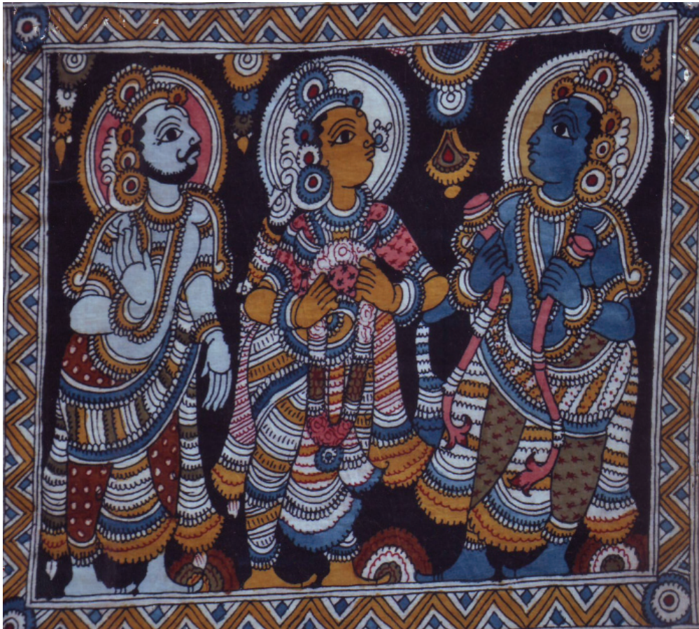
Fig. 15.5: Sita Swayamvar