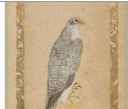
Falcon on a Bird Rest