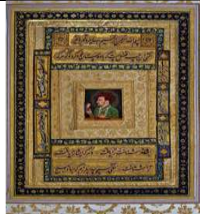
Jahangir Holding a Picture of Madina

Title – Jahangir Holding A Picture of Madona