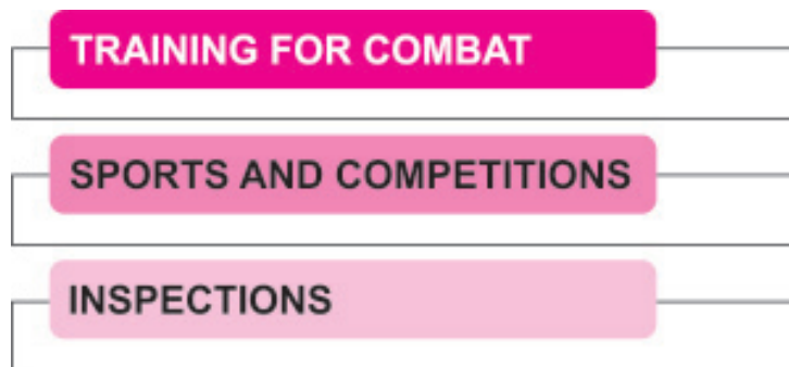
Table 2.1 - Training Structure