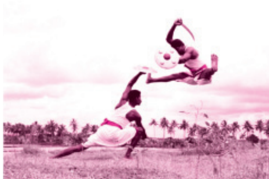
Fig. 2.1 : Kalaripayattu

Kalari was one of the most important educational institutions of South India.