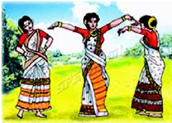
Fig. 8.1 Assam