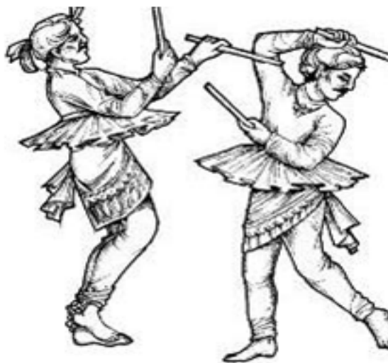
Fig. 3.3 Gujrat