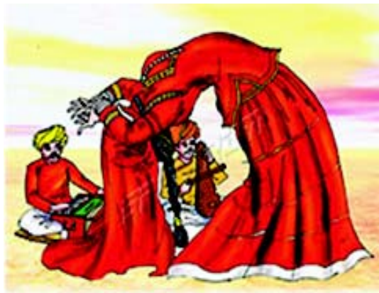
Fig. 3.14 Rajasthan