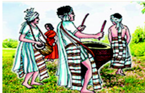
Fig. 3.11 Meghalaya