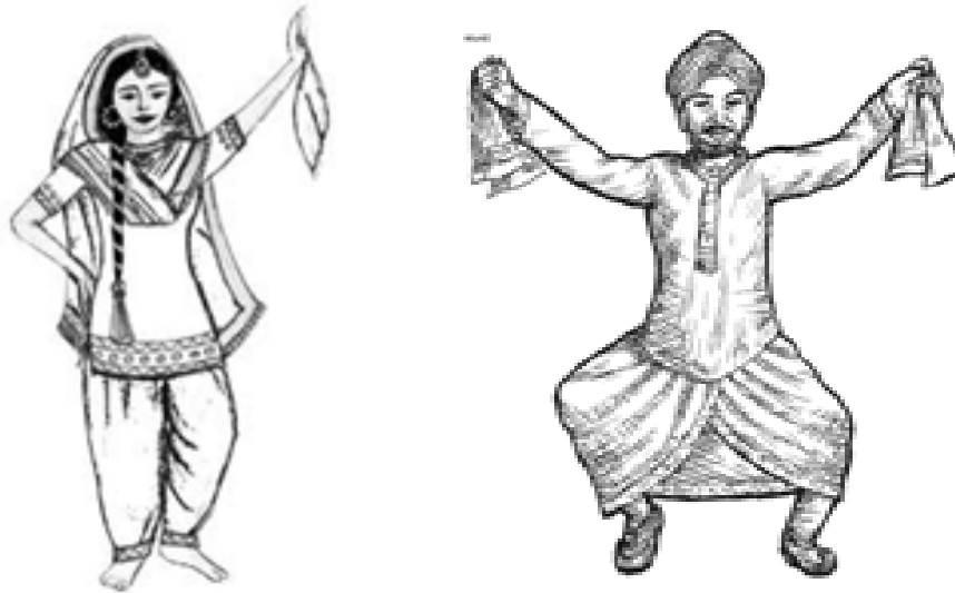
Fig. 3.13 Punjab