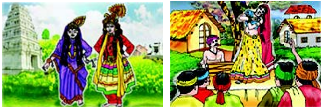
Fig. 3.16 Uttar Pradesh