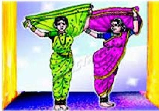
Fig. 3.10 Maharashtra