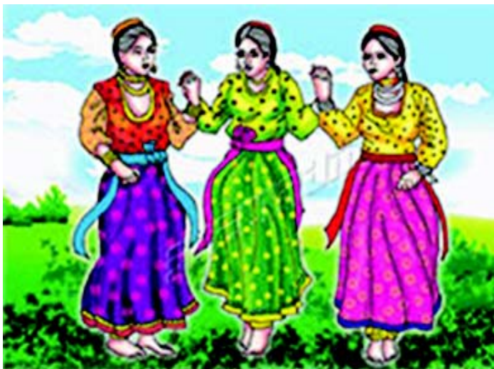
Fig. 3.5 Himachal Pradesh