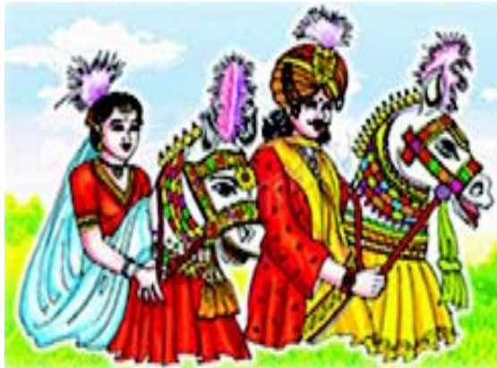
Fig. 3.15 Tamilnadu