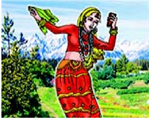
Fig. 3.17 Uttrakhand