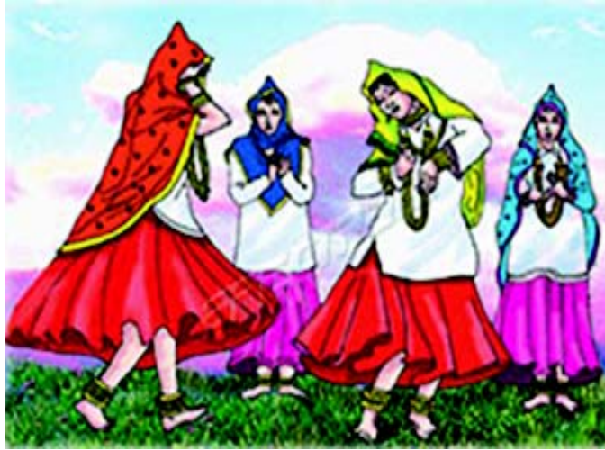
Fig. 3.4 Haryana