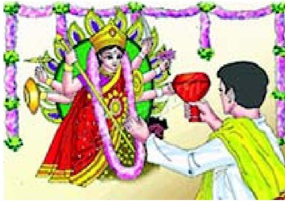
Fig. 3.19 West Bengal