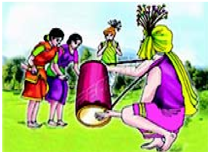
Fig. 3.9 Madhya Pradesh