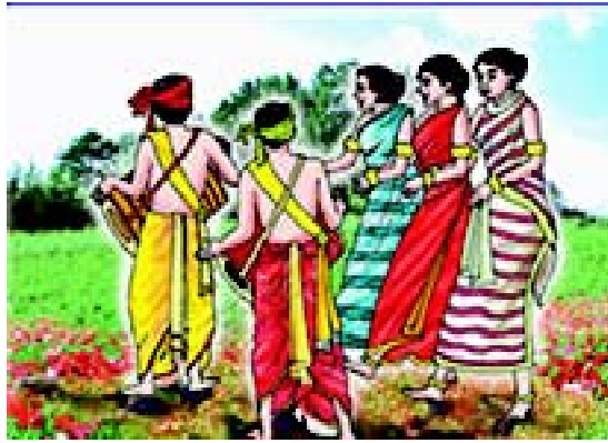
Fig. 3.2 Bihar