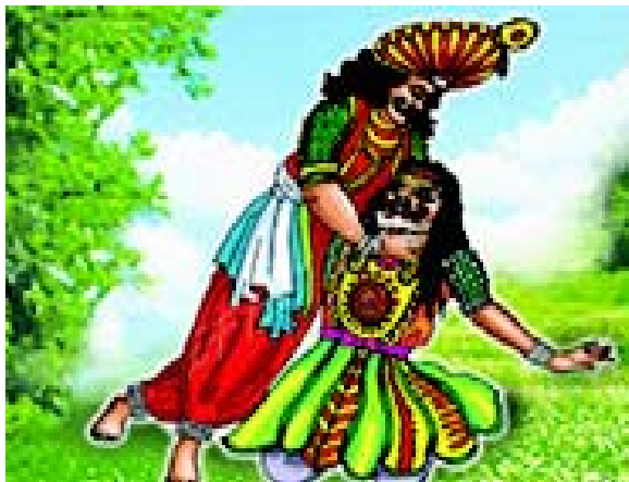
Fig. 3.7 Karnatka