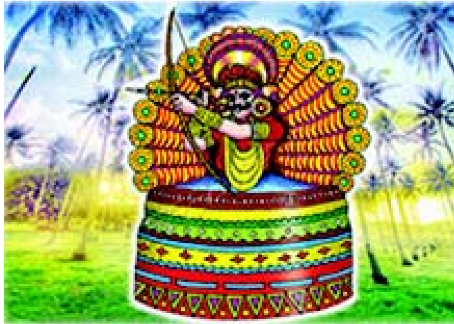
Fig. 3.8 Kerala