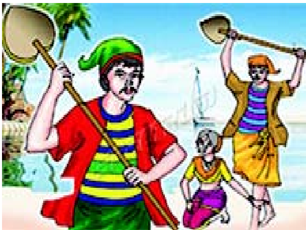
Fig. 3.18 Goa