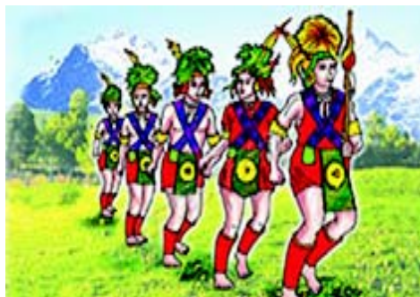
Fig. 3.12 Nagaland