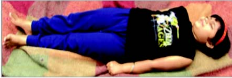
Fig. 7.10 Shavasana