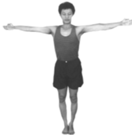
Fig. 7.1 Hands stretch breathing