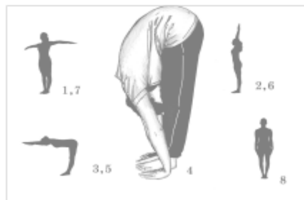
Fig. 7.7 Padahasthasana