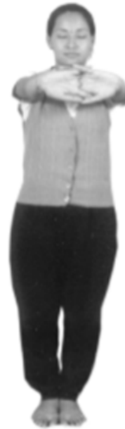
Fig. 7.3 Vertical practice