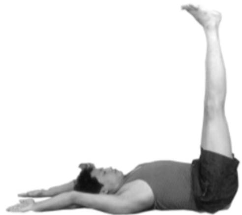
Fig. 7.5 Both Legs