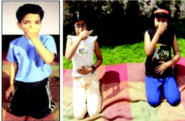
Fig. 7.11 Kapalabhati