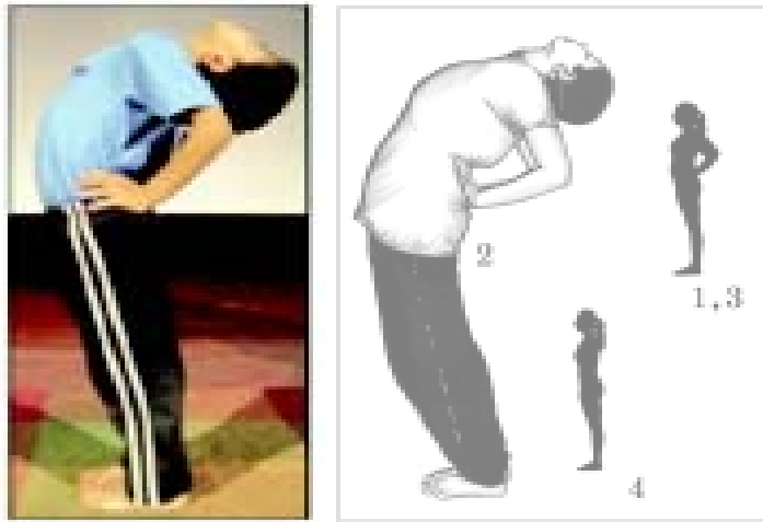
Fig. 7.8 Ardhchakrasan