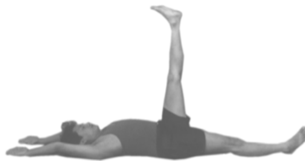
Fig. 7.4 Straight leg raise nreathing