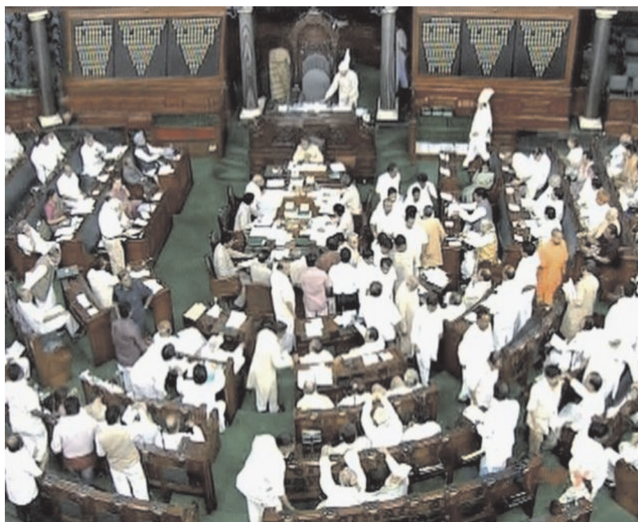
Figure 20.6 Session of Lok Sabha

Lok Sabha is presided over by the Speaker and in his/her absence by the Deputy Speaker. Members of the Lok Sabha elect the Speaker and the Deputy Speaker from among themselves. He/She maintains order and discipline in the lower house as well as supervises its proceedings. He/She decides who will speak and for how long. He/She normally does not cast his/her vote but can vote in case of a tie. The Speaker decides whether a bill is an ordinary or a money bill and his/her decision is final. Besides, he/she is the custodian of the rights and privileges of the members. In case of a joint sitting of the Lok Sabha and the Rajya Sabha, the Speaker of the Lok Sabha, presides over such meetings.