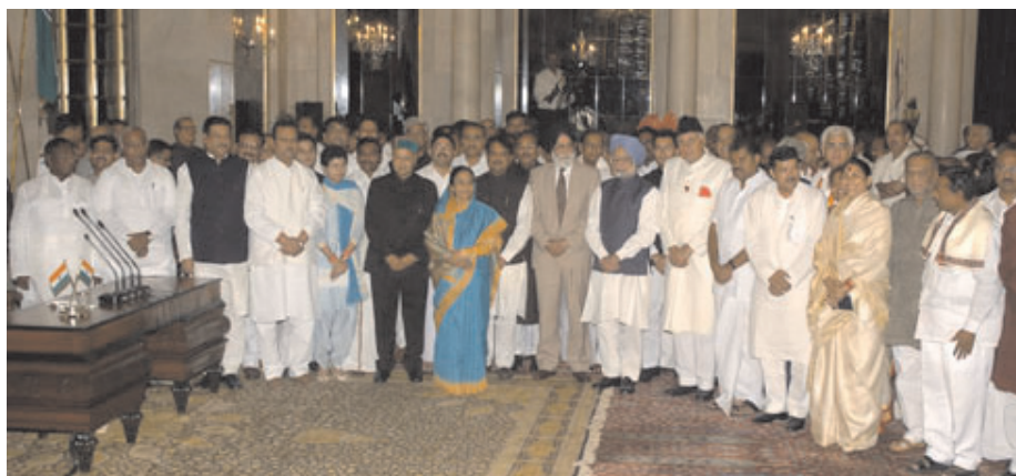
Figure 20.4 Members of the Union Council of Ministers after Taking Oath (2009)