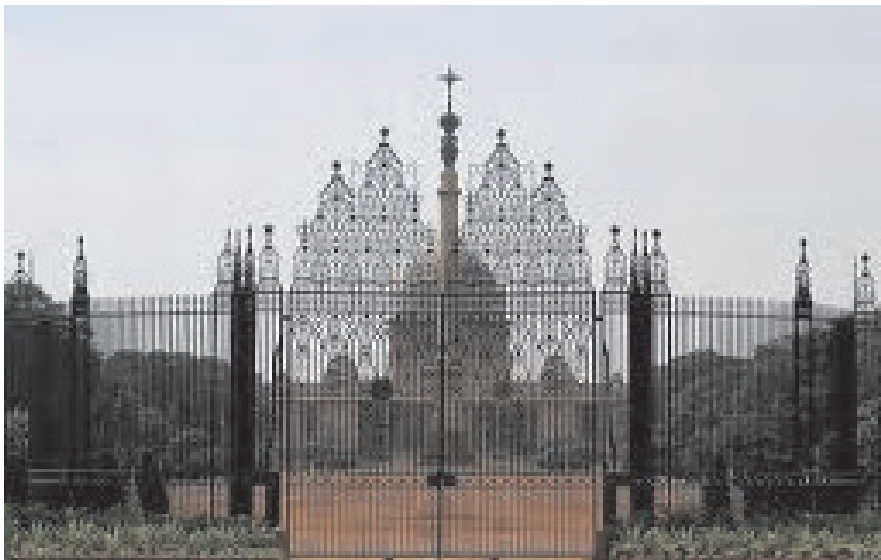
Figure 20.3 Rashtrapati Bhawan