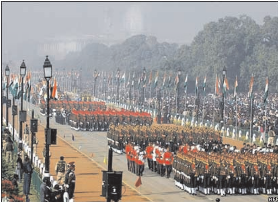
Figure 20.1 Republic Day Parade

The illustration below is showing the Republic Day Parade. We celebrate 26 January as Republic Day every year. India is known as a Republic. Do you know why? It is because our Head of the State, the President of India is elected. It is not so in Great Britain where the Head of State happens to be either the King or the Queen. The office there is hereditary.