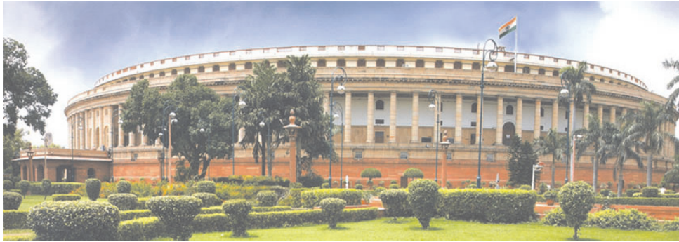
Figure 20.5 Parliament House, India