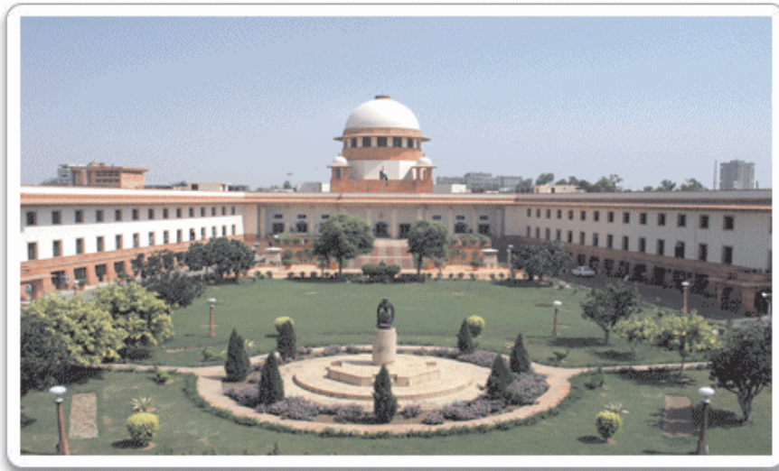
Figure 20.7 The Supreme Court of India

As provided in the Constitution, the Supreme Court of India consists of the Chief Justice and other Judges whose number is prescribed by the Parliament from time to time. In 1950 there was a Chief Justice and there were 7 Judges. But the number of Judges continued increasing as per the need. The Supreme Court, at present, consists of the Chief Justice and 30 Judges.