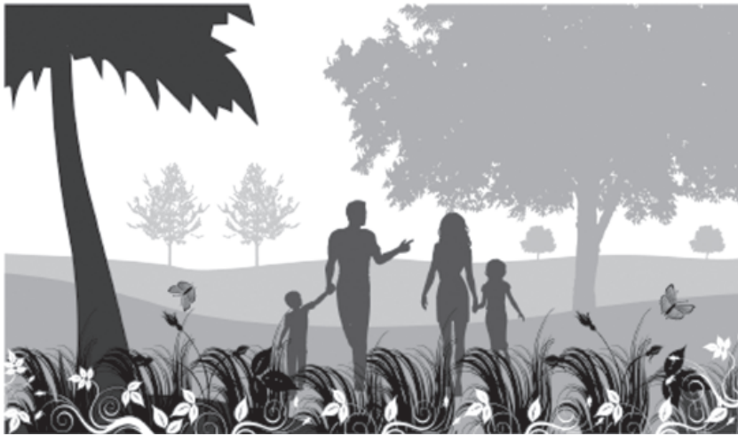
Figure 26.1 A couple playing in the park

is the non-living, known as Abiotic which includes such items as sunlight, soil, air, water, land, climate etc.