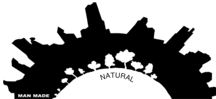
Figure 26.2 : Classification of Environment

Human-made environment: On the other hand, human-made environment includes all those things which are created by humans for their use. Human beings construct these surroundings, as these are needed for providing the required setting for human activity. These things range from the large-scale civic surroundings to personal places. For example, houses, roads, schools, hospitals, railway lines, bridges and parks are components of human-made environment.