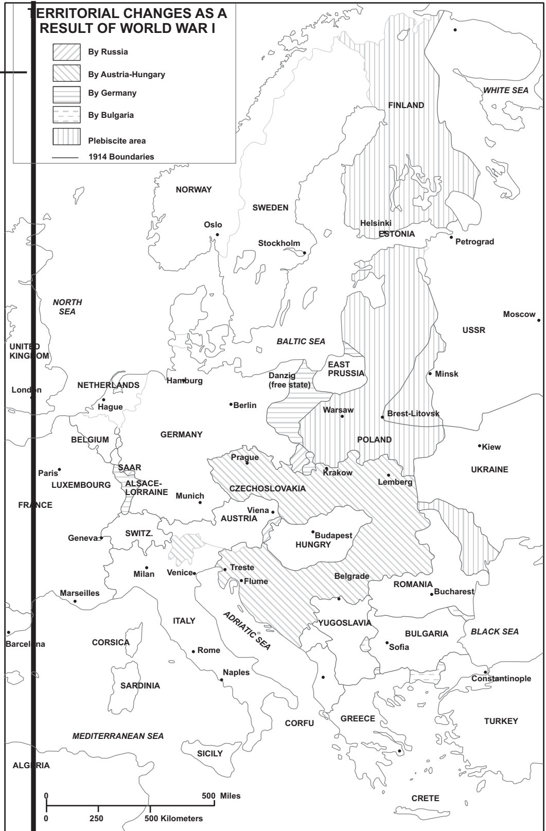
Map 24.1 Territorial Changes as a Result of World War I