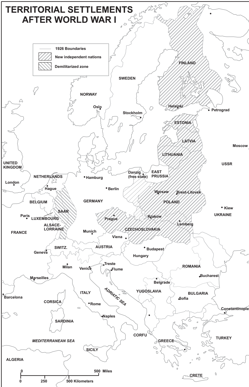
Map 24.2 The Changed map of Europe 2 Block