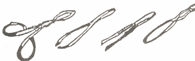
Types of tweezers