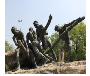
Triumph of Labour Title – Triumph of Labour Artist – Devi Prasad Roy Chawdhary Medium – Bronze Date – 1954