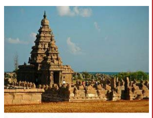
Group of Monuments at Mahabalipuram

The development of cave architecture is another unique feature and marks an important phase in the history of Indian architecture. More than thousand caves have been excavated between second century BC and tenth century AD. Famous among these were Ajanta and Ellora caves of Maharashtra, and Udaygiri cave of Orissa. These caves hold Buddhist viharas, chaityas as well as mandapas and pillared temples of Hindu gods and goddesses.