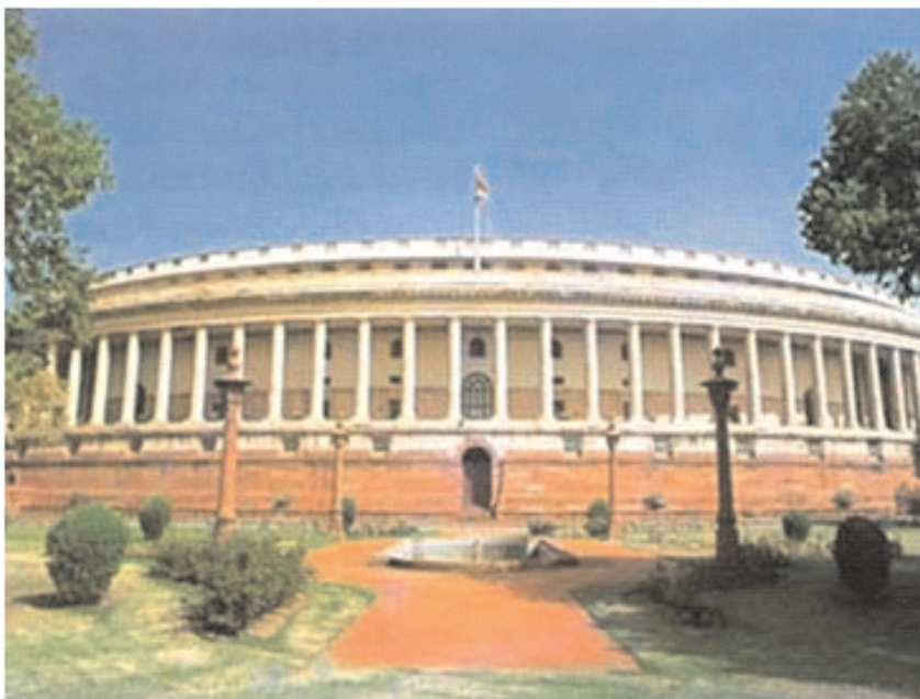
Figure 15.2 Parliament of India