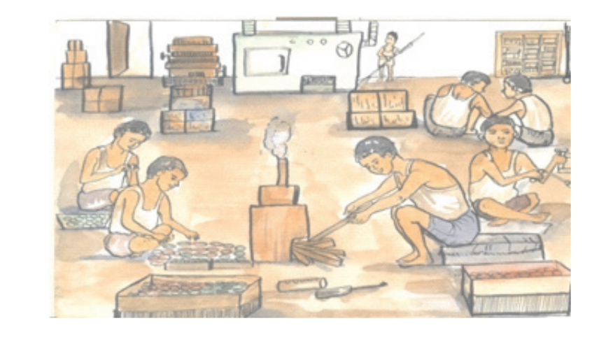
Figure 16.3 Children working in hazardous situation

3. Prohibition of employment of children in factories, etc.: As the Constitution provides, no child below the age of fourteen years shall be employed to work in any factory or mine or engaged in any other hazardous employment. This right aims at eliminating one of the most serious problems, child labour, that India has been facing since ages. Children are assets of the society. It is their basic right to enjoy a happy childhood and get education. But as shown in the illustration and as you also may have observed, in spite of this constitutional provision, the problem of child labour is still continuing at many places. This malice can be eliminated by creating public opinion against it.