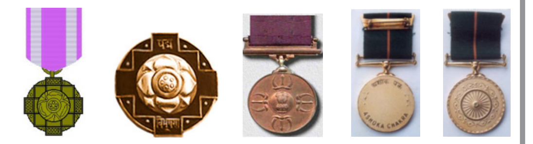
(Bharat Ratna, Padma Vibhushan, Pramvir Chakra, Veer Chakra, Ashok Chakra) Figure 16.2 Medals Showing Civil and Military Awards

(v) Abolition of Titles: All the British titles like Sir (Knighthood) or Rai Bahadur which were given to the British loyalists during the British rule, have been abolished because they created distinctions of artificial nature. However, the President of India can confer civil and military awards to those who have rendered meritorious service to the nation in different fields. The civil awards such as Bharat Ratna, Padma Vibhushan, Padam Bhushan and Padma Shri and the military awards like Veer Chakra, Paramveer Chakra, Ashok Chakra are conferred. Do you know that these awards are not titles? Educational and military awards can be prefixed with one's name?