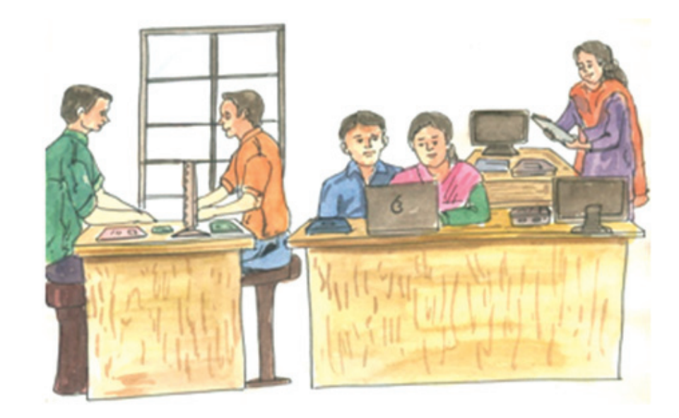
Figure 16.1 Working in Office Without Gender Based Discrimination

(iv) Abolition of Untouchability: Practising untouchability in any form has been made a punishable offence under the law. This provision is an effort to uplift the social status of millions of Indians who had been looked down upon and