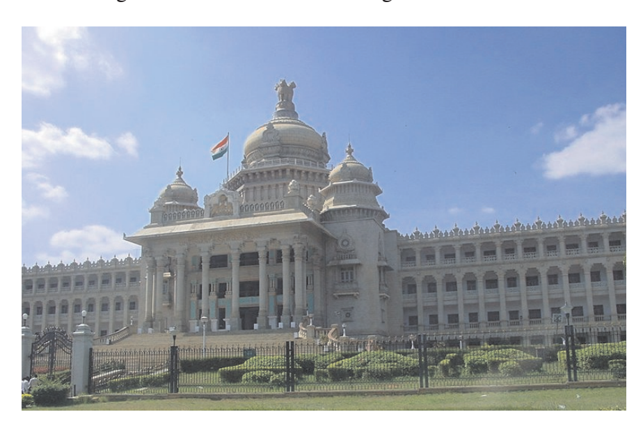
Figure 19.2 Vidhan Saudha (Vidhan Sabha) Bangaluru

Every State has its Legislature. You are seeing below the building of the State Legislature of Karnataka. Let us understand how the State Legislatures are constituted. In some of the States the Legislature is bicameral i.e. has two houses. In most of the States it is unicameral i.e. has only one house. The Governor is an integral part of the State Legislature. The unicameral legislature has the Legislative Assembly and the bicameral has the Legislative Assembly being its Lower House and the Legislative Council the Upper House. At present only Bihar, Jammu & Kashmir, Karnataka, Maharashtra and Uttar Pradesh have bicameral legislatures and the remaining 23 States have unicameral legislatures.