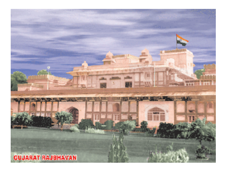
Figure 19.1 Raj Bhavan, Ahamedabad

system. At the state level, there is a Governor in whom the executive power of the State is vested by the Constitution. But the Governor acts as a nominal head, and the real executive powers are exercised by the Council of Ministers headed by the Chief Minister.