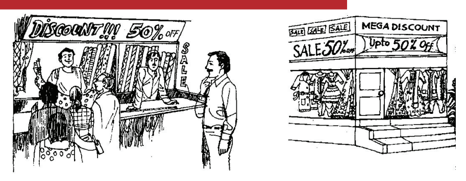
Means of Sales Promotion