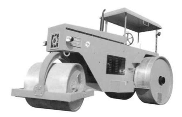
Fig. 17.2: Road Roller

When the subgrade is made of black cotton soil due to capillary rise of water extra precautions are required to be taken. In that case thin sub base should be made below the base, out of Murram or coarse sand. This sub base will be of stone or boulder soling and roller should be moved over this after spraying water.