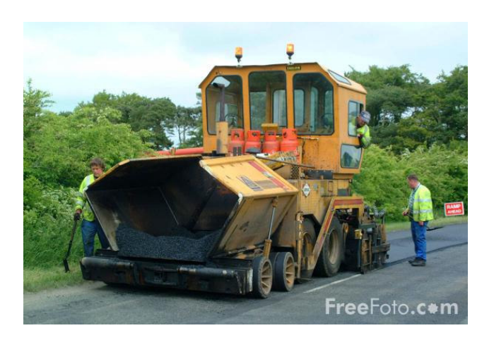
Fig. 17.4: Paver machine

Consolidation: Consolidation is the process of pressing the spread boulders with roller. When Bitumin grit is spread on a good amount of area for premix carpeting, then compacting is done by rolling through the roller of 6 to 8 tonne weight. During the movement of the roller, its wheels are kept wet through wet sacks otherwise hot boulders stick to the wheels again and again.