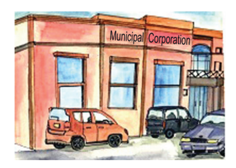
Figure 18.5 Municipal Corporation

total seats for women. There is also a provision of reservation of seats for Scheduled Castes, Scheduled Tribes and other weaker sections in proportion to their population. Out of these reserved seats for Scheduled Castes and Scheduled Tribes, one-third would be reserved for women belonging to these communities. In the event of dissolution of Municipal Corporation, the elections will be held within six months. There is an official post of Municipal Commissioner, who is the Chief Executive Officer and is appointed by the State government. In case of Union Territories like Delhi it is done by the Central government.