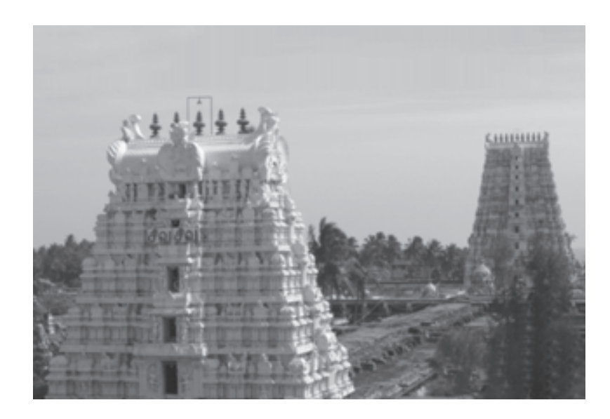
Figure 9.5 Temple of Rameshwaram

Culture and Heritage in India-I: Hinduism, Jainism and Buddhism