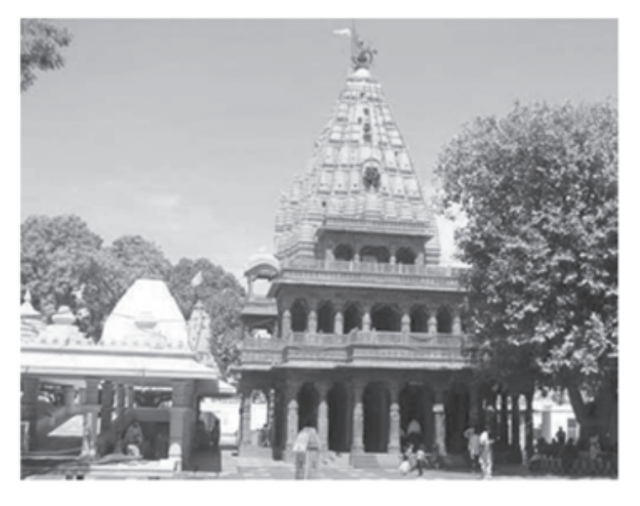
Figure 9.2 Temple at Kashi

Varanasi, earlier known as Banaras or Kashi is the most sacred among the holy places. It is the city of Shiva, having over two thousand temples and over half a million idols, most of them dedicated to Shiva and his family. It is situated on the banks of the holy river, the Ganga. French traveller, Francois Bernier (1656-1668 AD) in addition to the religious significance, explains the educational importance of Banaras. There were many Gurukuls in Banaras. In his words, "The town of Banaras, seated on the Ganges, in a beautiful situation, and in the midst of an extremely fine and rich country, may be considered the general school of the Gentiles (Hindus). It is the Athens of India. The town contains no colleges or regular classes, as in our universities (European universities), but