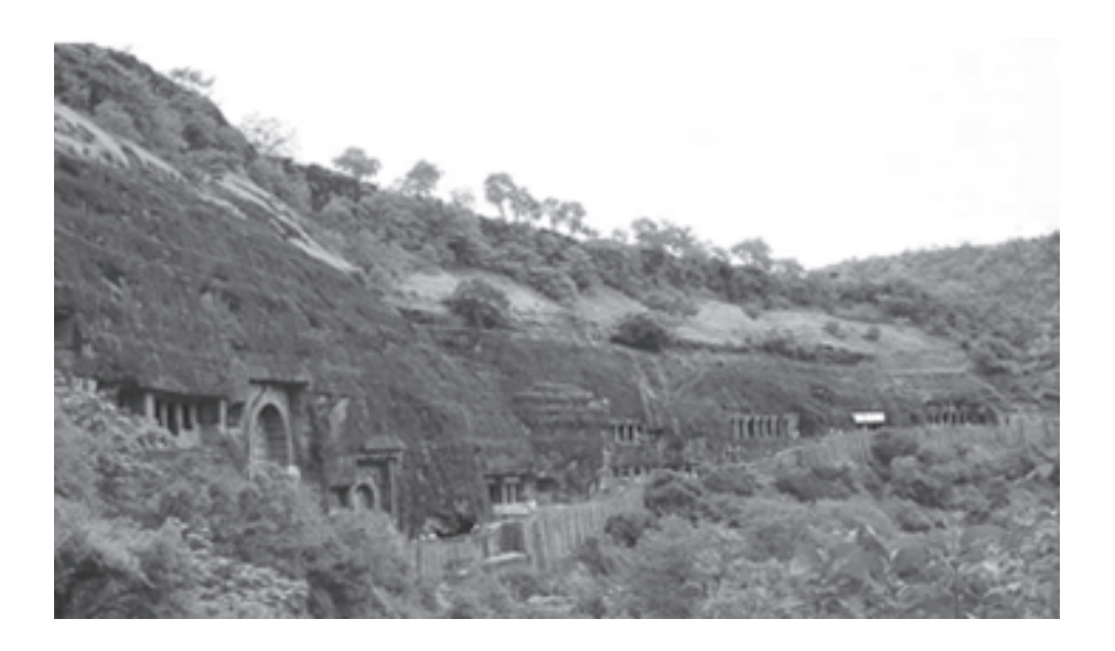
Figure 9.9 Ajanta Caves

Ajanta, Aurangabad, Maharashtra: The original Buddhist caves date from the Second and First Century BC. The caves have paintings and sculptural additions made during the time of the Guptas. The Ajanta Caves (75°40' E; 20°30' N) are situated at a distance of 107 km north of Aurangabad. The caves got the name from a nearby village named Ajanta located about 12 kms. These caves were discovered by an Army Officer in the Madras Regiment of the British Army in 1819 during one of his hunting expeditions. Instantly the discovery became very famous and Ajanta became a very important tourist destination in the world. The caves, famous for its murals, are the finest surviving examples of Indian art, particularly painting.