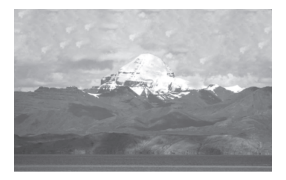
Figure 9.3 Mount Kialash

Mount Kailash is a sacred pilgrimage place of Asia and lies in the South-West of Tibetan region of China-Nagri, towering 6714 meters above the Tibetan Plateau. According to the Hindu mythology, it is said to be the home of Lord Shiva