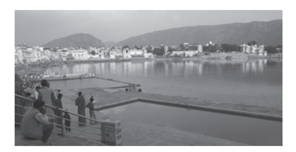
Figure 9.7 Pushkar

Tirupati Balaji Temple : Located in a small district called Chittoor in southern Andhra Pradesh, is the famous Tirupati Balaji Temple of India. This temple is believed to be the richest temple in India because of the rich offerings made by the devotees.