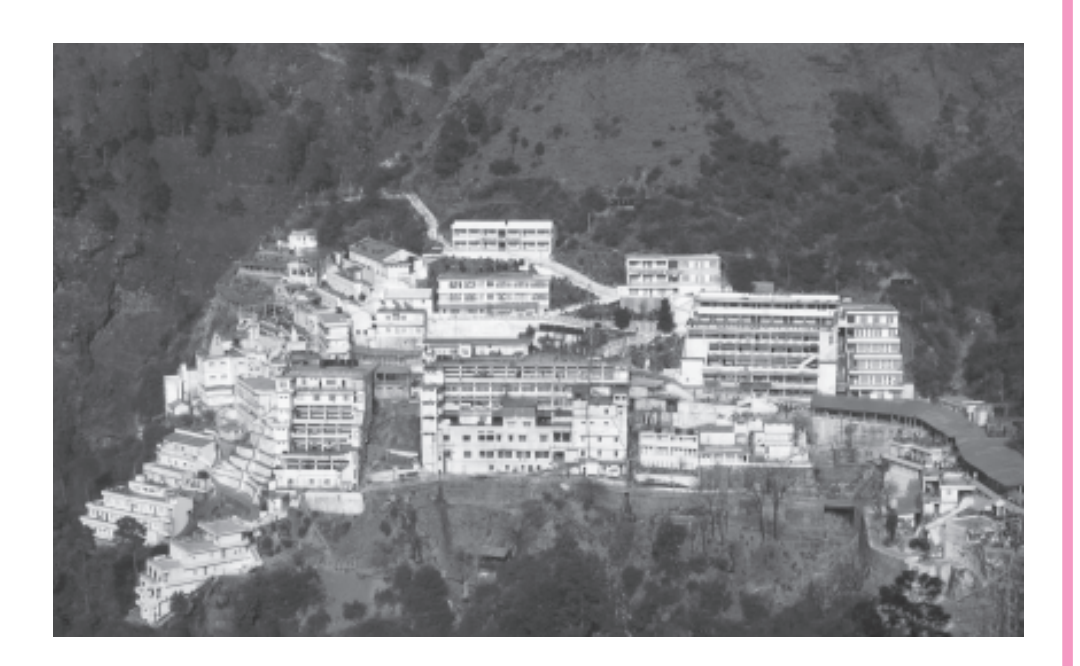
Figure 9.8 Vaishno Devi

Vaishno Devi Temple : Located in the mighty Trikuta Mountains at a distance of 60 kilometers from Jammu, is the famous Vaishno Devi Temple. It is one of the most visited and worshipped pilgrimages in India.