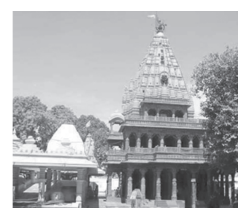
Figure 9.6 Temple at Ujjain

Ujjain is situated on the eastern bank of River Shipra. It is one of the oldest cities of India. It is located in the Malwa region of Madhya Pradesh. In ancient times, Ujjain was known by the names of Ujjayini and Avanti.