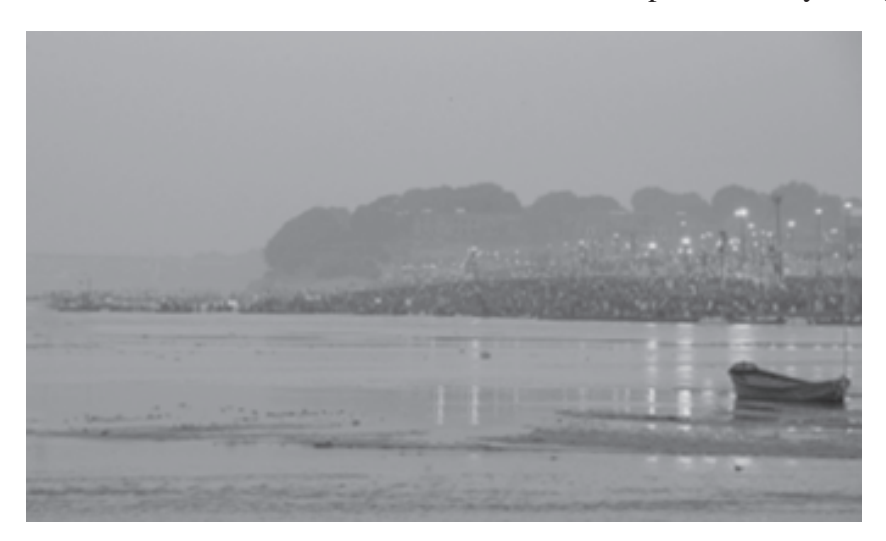
Figure 9.4 Holy Ganga

Prayag, where the rivers' Ganga and Yamuna meet, is one of the ancient pilgrimage centers of India. Prayag is situated in Allahabad (the city of Allah). Prayag is venerated in the hymns of the Rig Veda. The famous Kumbh mela is also held here in which lakhs of devotees take a dip in the holy Ganga.