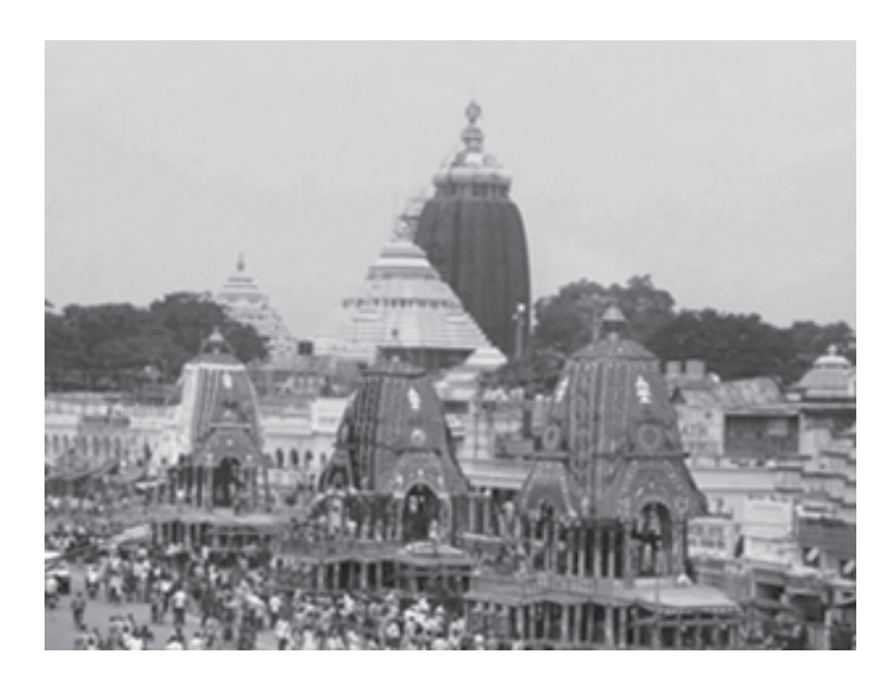
Figure 9.1 Puri

his sister Subhadra are placed side by side. One of the most interesting events associated with Puri is the annual Rath Yatra which is not only a major tourist attraction but a place for massive gathering of devotees who gather there. In this Rath Yatra, the three idols are taken out in their respective Raths, pulled by thousands of people on the streets of Puri. They are taken to the Gundicha temple and after some days are brought back to their eternal place. (Figure 9.1)