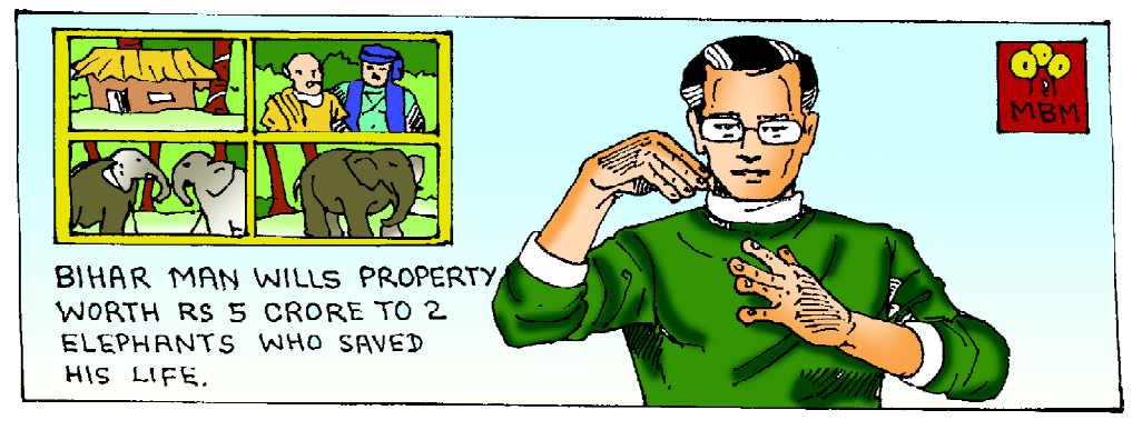
Figure-16.5 : News

These news reading programmes are done by deaf people. News interpreting is organised by some mainstream TV channels. Examples are: