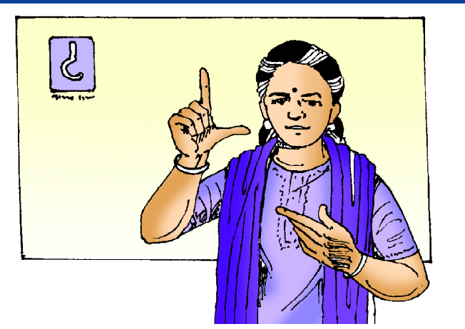
Figure-16.4 : News