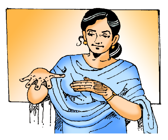
Figure-17.2: India Deaf Can TV

Example: YouTube video 'India Deaf Can TV'