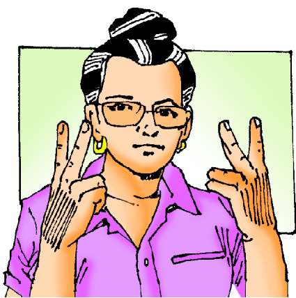
Figure-17.4: Instagram stories