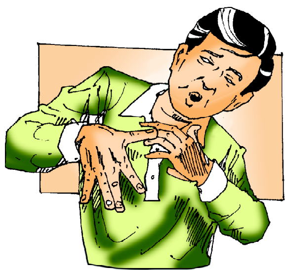
Figure-8.4 : EXTREMELY-SPICY

The movement and facial expression is stronger when we want to say "very" or "extremely" in signs.