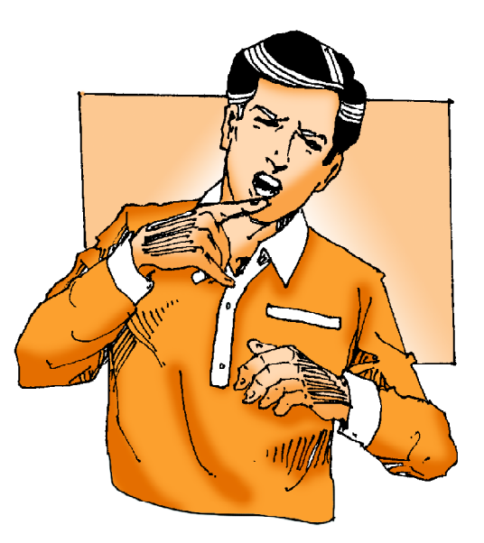
Figure-8.3 : VERY- SPICY