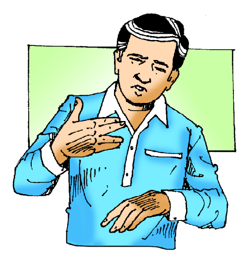
Figure-8.2 : SPICY

Some rules in the grammar are about changing the form of a sign, for example: