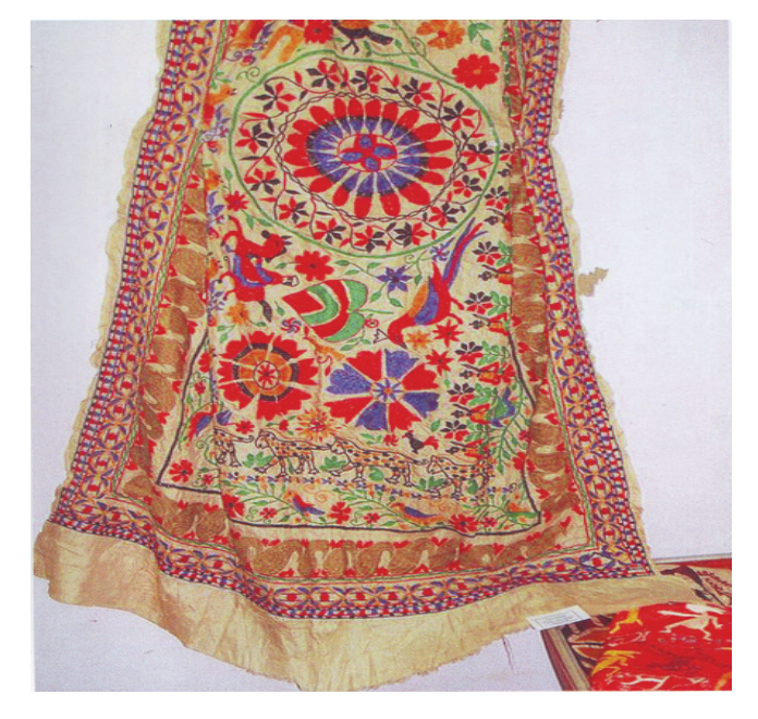
Fig. 6.4: Kantha Work

In West Bengal, the tradition of Kantha making is represented by village women of Hindu and Muslim communities. People of Bengal (particularly village women) are highly religious, and their gods and goddesses naturally influence them. The Hindu Kantha makers tend to choose from religious motifs, like gods and goddesses, whereas Muslim women restrict themselves to geometrical designs, flora, fauna, etc. From an early age, most of the community women used to make Kanthas in their leisure time, but now it has become limited to a specific section of society.