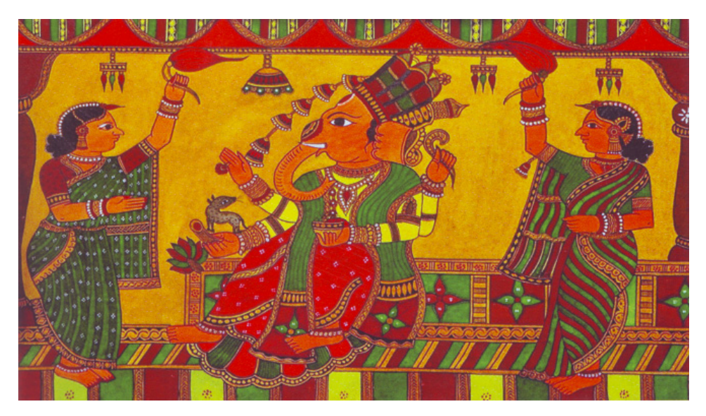
Fig. 6.2: Phad Painting

Other stories from 'Ramayana' and the life of Lord Krishna are also painted on Phad to provide entertainment. The image of Ganesha is also very popular.