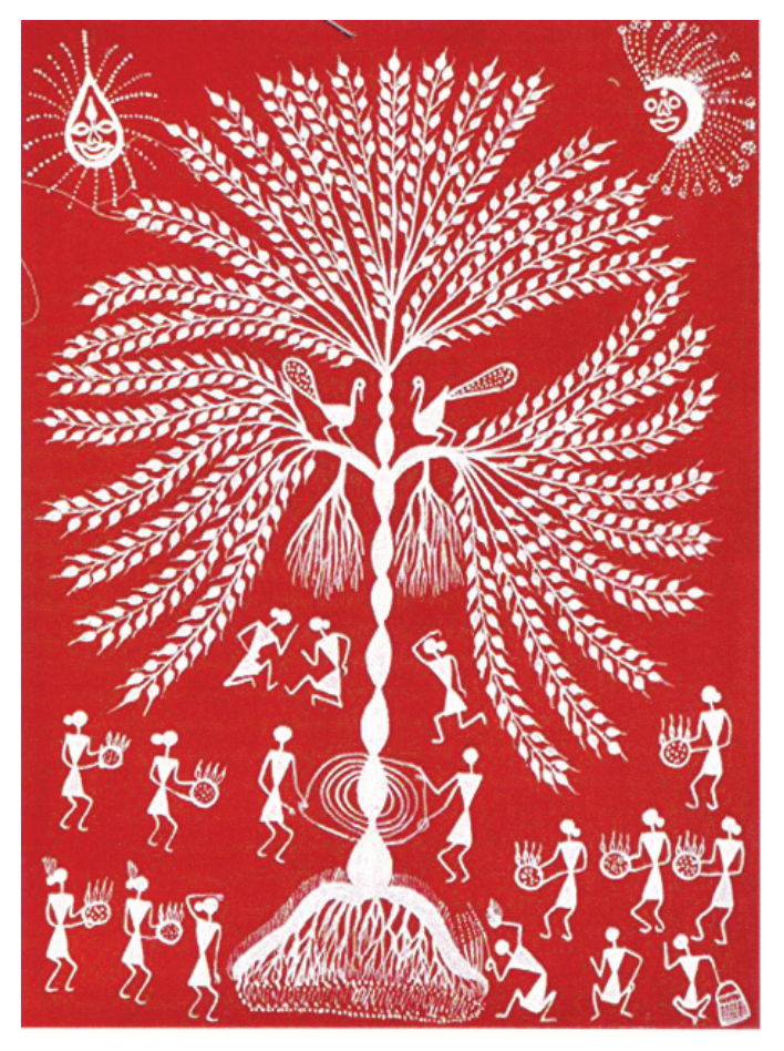
Fig. 6.3: Warli Painting

In India, women's role in ritual life is more important than others. Throughout the country these rituals dominate the majority of domestic ceremonies like weddings, fasts etc. For these rituals, the women have to undergo traditional training from their early girlhood. Warli painting in Maharastra is a such kind of community creative painting.