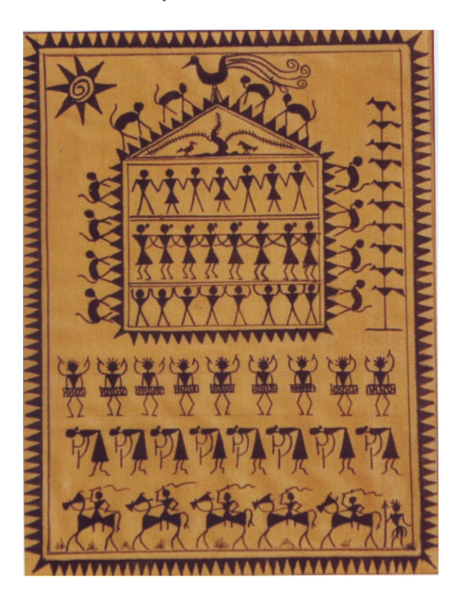
Fig. 6.1: Soura Folk Art

After initial drawing the artist sends that for suggestion from the priests. Then according to the suggestion - the artist adds the necessary items. Thus the painting consists of animate and inanimate objects, indigenous plants, animals, tools, instruments etc. However, some everyday things like trains, cars, and aeroplanes are also introduced due to exposure to the outside world.