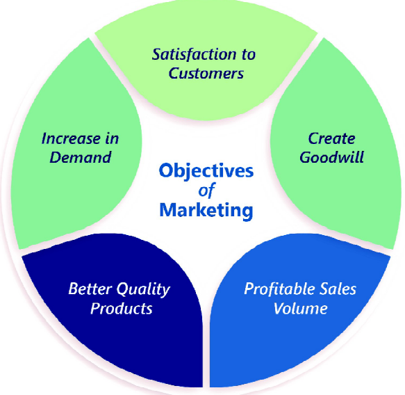
Fig. 14.2 Objectives of Marketing

After knowing the points of importance of marketing let us discuss the basic objectives of marketing.