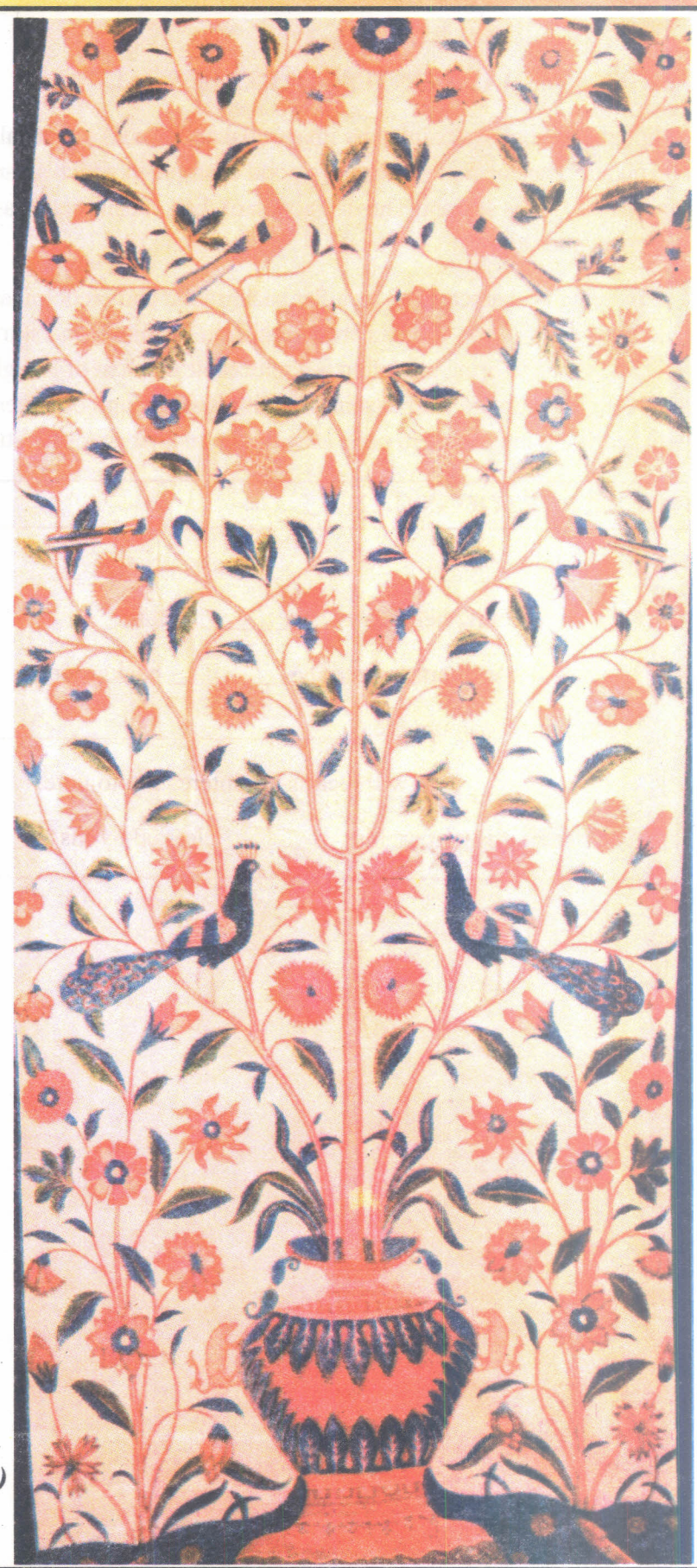
Kalamkari (Andhra Pradesh)