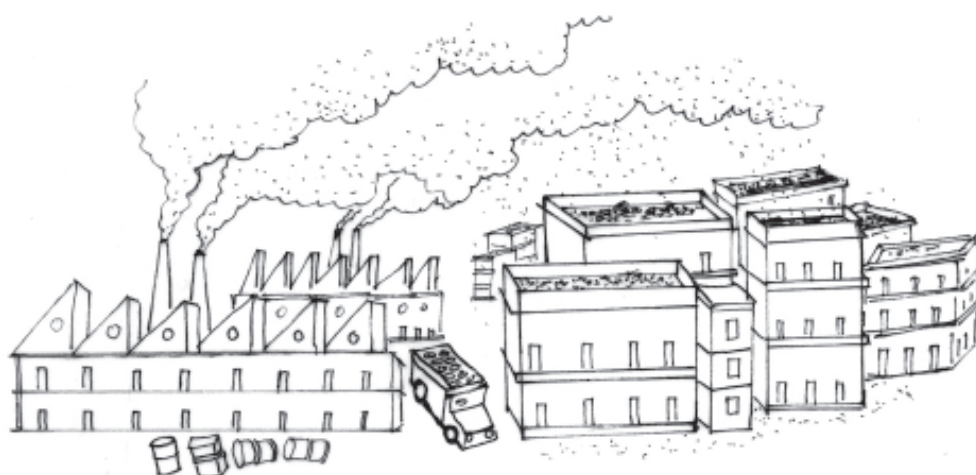
Fig. 11.4: Factory chimney emitting thick cloud of smoke and settling of fly ash