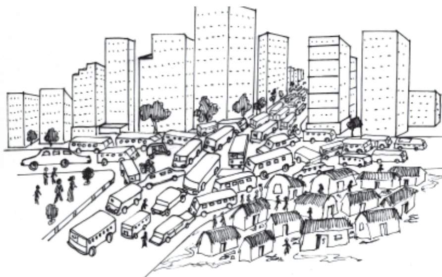
Fig. 11.1: Frequent traffic chaos in a city

In most of the cities there is lack of proper drainage. As a result accumulation of waste water form puddles of dirty water. Animals like cattle, dogs and pigs roam freely in cities and their excreta etc. make sanitation problems worse. Roads are not proper and the different types of transport further pollute the environment and cause health problems.