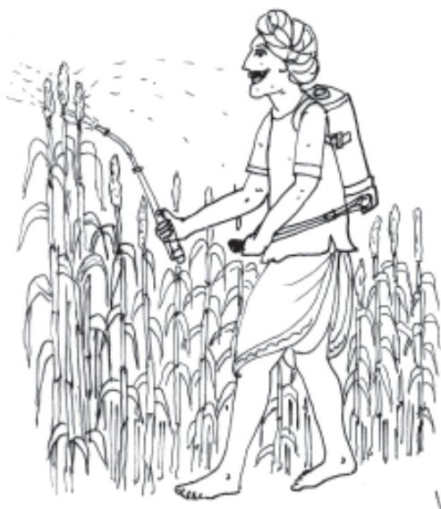
Figure 11.7: Spraying of defoliators and fall out of spray on people

Pesticides: Excessive use of pesticides particularly herbicides like 2,4-dichlorophenoxyacetic acid (2,4-D) has been associated with a 200-800% increase of NHL (Non-Hodgkin’s Lymphoma) – one type of cancer in Sweden. Pesticides such as toxaphene, hexachlorocyclohexane (BHC), trichlorophenol, dieldrin, DDT are known to cause lymphatic cancer in rats and mice. The danger is increased due to the persistent nature of the residues of these pesticides in the environment resulting in chronic exposure to low levels of pesticides. The use of all these pesticides has now either been banned or restricted. Organic farming and emphasis on Integrated Pest Management (IPM) as an alternate and environment friendly method of pest control. Asbestos, nickel, cadmium, radon, vinyl chloride, benzidine and benzene are well known carcinogens. Reduction in exposure to these will reduce the incidence of various types of cancer.