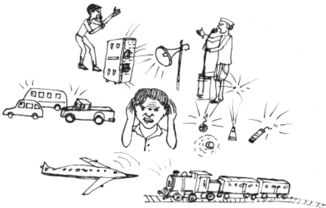
Fig. 11.10: Noise pollution