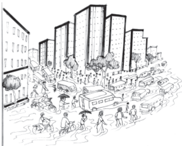
Figure 11.5: Traffic congestion in cities during rainy season

High level of suspended particulate matter is one of the major pollutants in urban areas. This is caused by multifarious human activities such as movement of traffic, smoke from industries and diesel vehicles from automobiles gases like oxides of sulphur, oxides of nitrogen, hydrocarbons, carbon monoxide and carbon dioxide. In addition many trace metals such as iron, zinc and magnesium are found associated with suspended air particulates.