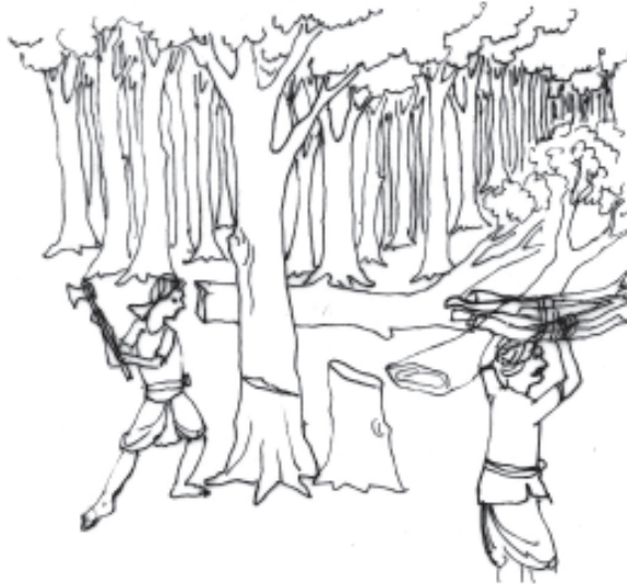
Fig. 11.9: People cutting trees and carrying logs

Workers who are exposed to heavy physical work loads are miners, lumberjacks, construction workers, farmers, fishermen, storage workers and healthcare personnel. Repetitive tasks and static muscular load can lead to injuries and musculoskeletal disorders and may result in short-term and permanent work disability. Unshielded machinery, unsafe structures and dangerous tools are some of the most prevalent work place hazards.