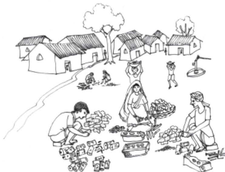
Fig. 11.8: Lead pollution – recovering lead from old batteries

Lead enters the atmosphere from automobile exhaust. Tetraethyl lead (TEL) was added to petrol as an anti-knock agent for smooth running of automobile engines. TEL has now been replaced by other anti-knock compounds to prevent emission of lead by automobiles. Lead in petrol is being phased out by introduction of lead free petrol. Many industrial processes use lead and it is often released as a pollutant. Battery scrap also contain lead. It can get mixed up with water and food and create cumulative poisoning. It can cause irreversible behavioural disturbances, neurological damage and other developmental problems in young children and babies. It is a carcinogen of the lungs and kidneys.