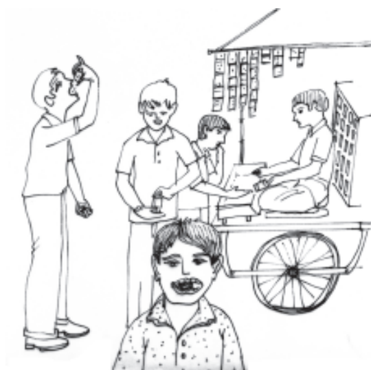
Figure 11.6: People eating tobacco/ snuff and showing cancer of mouth

Smoking tobacco or being regularly exposed to tobacco smoke are responsible for about 85% of all cancer deaths. Smoking may increase the chances of getting cancers of stomach, liver, prostate, colon and rectum. Use of smokeless tobacco, chewing tobacco and snuff cause cancer of mouth and throat. Exposure to environmental tobacco smoke, termed passive smoking also increases the risk of lung cancer for non-smokers. The risk of cancer begins to decrease soon after quitting smoking and chewing tobacco. This risk continues to decline gradually after quitting.