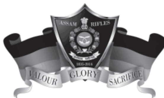
Fig.18.2 Assam Rifles Logo

The Force is a potent organization with 46 battalions and its associated command and administrative back up. It is designated by the GoM committee as the Border Guarding Force for the Indo - Myanmar border and is also its lead intelligence agency. Look at the logo of the Assam Rifles given below.