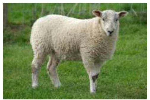
words each to describe them.

the contrast between the monkey and the squirrel. Now, look at the pictures given below and write 3