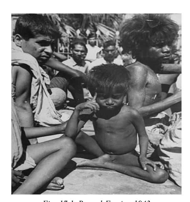
Fig. 17.1 Bengal Famine 1943

Farmers were forced to grow cash crops also because they had to pay the high revenue, rents and debts in cash. The shift away from food crops like jowar, bajra and pulses to cash crops often created disaster in famine years. A decline in world demand for Indian cotton led to heavy indebtedness, famine and agrarian riots in the Deccan cotton belt in the 1870s. The jute industry collapsed in the 1930s, which was followed by a devastating famine in 1943 in Bengal. Although, causes of these famines have been widely debated by historians, it is undeniable that the aggregate production of food crops remained far behind population growth, and millions of people died of starvation and epidemics.