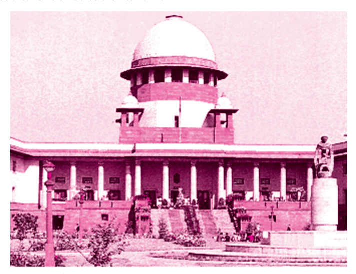
Figure 13.3: Supreme Court of India

Indian judiciary is a single integrated and unified system of Courts for the Union as well as the States, which administers both the Union and State laws, and at the head of the entire system stands the Supreme Court of India. The development of the judicial system can be traced to the growth of Modern–Nation–States and constitutionalism.