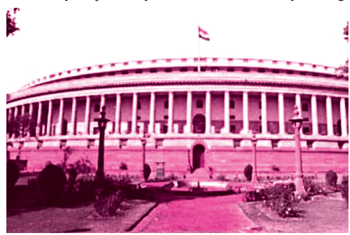
Figure 13.2: Parliament of India

organs which might violate the Constitution, structure and powers assigned to them. Only Judiciary has the powers of interpreting the Constitution and its mandates, and the say of judiciary has to be followed by all organs.