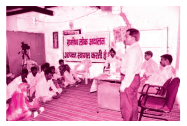
Figure 16.1: Lok Adalat

'Lok Adalat' is a system of conciliation or negotiation. It is also known as 'people's court'. It can be understood as a court involving the people who are directly or indirectly affected by the dispute or grievance. 'Lok Adalat', established by the government settles dispute through conciliation and compromise. The First 'Lok Adalat' was held in Chennai in 1986. 'Lok Adalat' accepts the cases which could be settled by conciliation and compromise and pending in the regular courts within their jurisdiction.