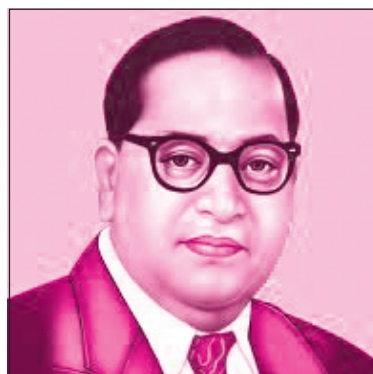
Figure 18.2 Dr. B.R. Ambedkar Chairman of Drafting Committee of Constitution