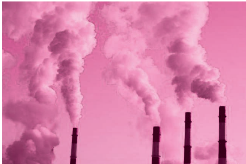
Figure 24.3: Smoke coming out of Chimneys

The most common air pollutants in urban areas include Sulphur dioxide (SO 2 ), Nitrogen oxides (NO & NO 2 ), Carbon monoxide (CO), etc. Apart from this, the gases discharged from refrigerators, air conditioners etc. are responsible for depletion of the Ozone layer.