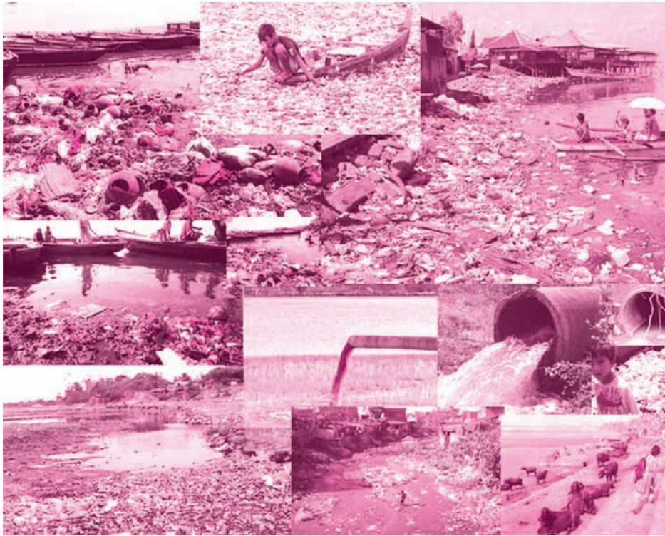
Figure 24.1: Various Sources of Water pollution

directly or indirectly into water bodies without adequate treatment to remove harmful compounds.