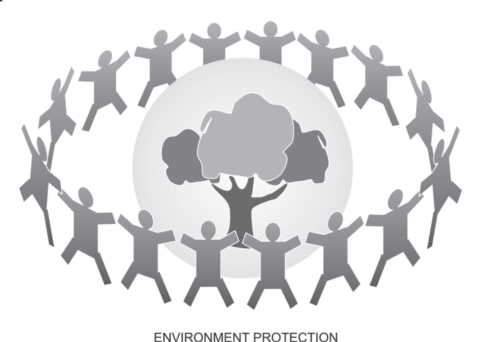
Figure 26.2: Protect Environment

sustainable development which requires that the developmental activity must be stopped and prevented if it causes serious and irreversible environmental damage.