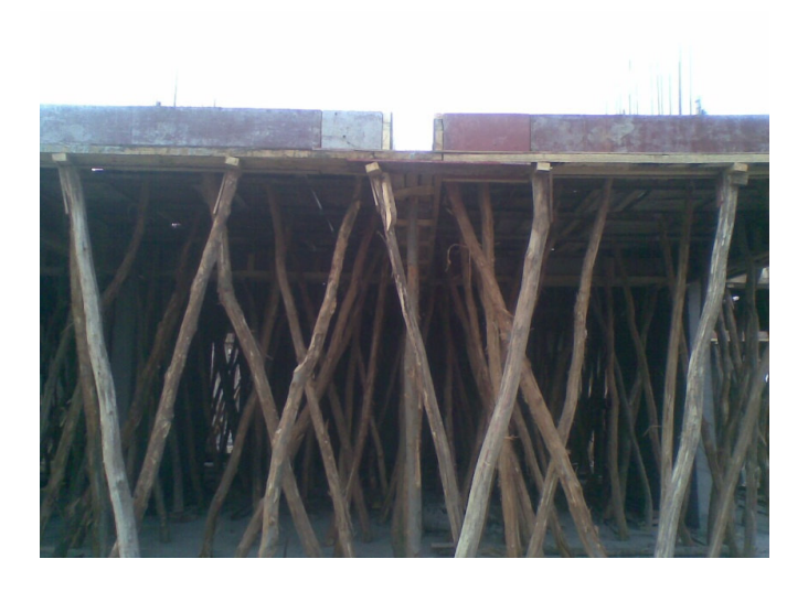
Fig. 11.3: Ballies below wood planks

Shuttering should be kept at the middle (4 mm in a meter span) to hold concrete not below the horizontal level when settled with their own weight.