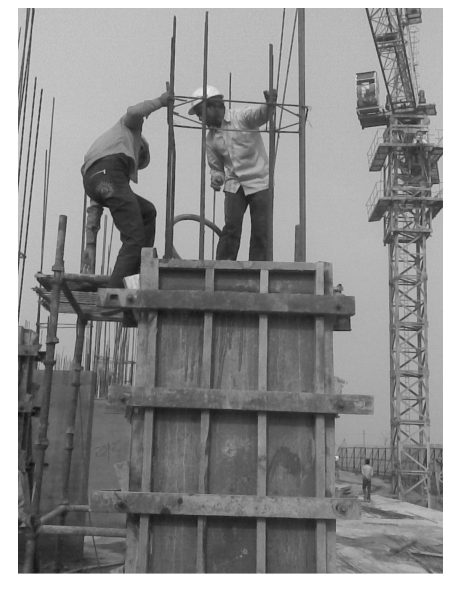
Fig. 11.2: Form work for column

The wooden planks or steel panels used as mould, in which concrete is poured and the stand of ballies (Bamboos) or steel posts is known as shuttering. It is provided till concrete get hardened to bear loads. The diameter of ballies should not be less than 100 mm and at extreme 80 mm. Ballies should be provided at the distance of the column and should be placed straight. Wooden planks of size 40 \times 40 cm. are provided at the bottom of ballies.