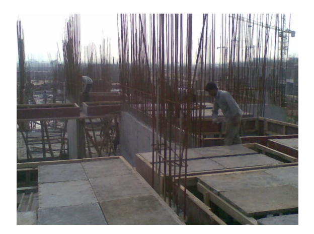
Fig. 11.4: Horizontal shuttering

Shuttering should be kept at the middle (4 mm in a meter span) to hold concrete not below the horizontal level when settled with their own weight.