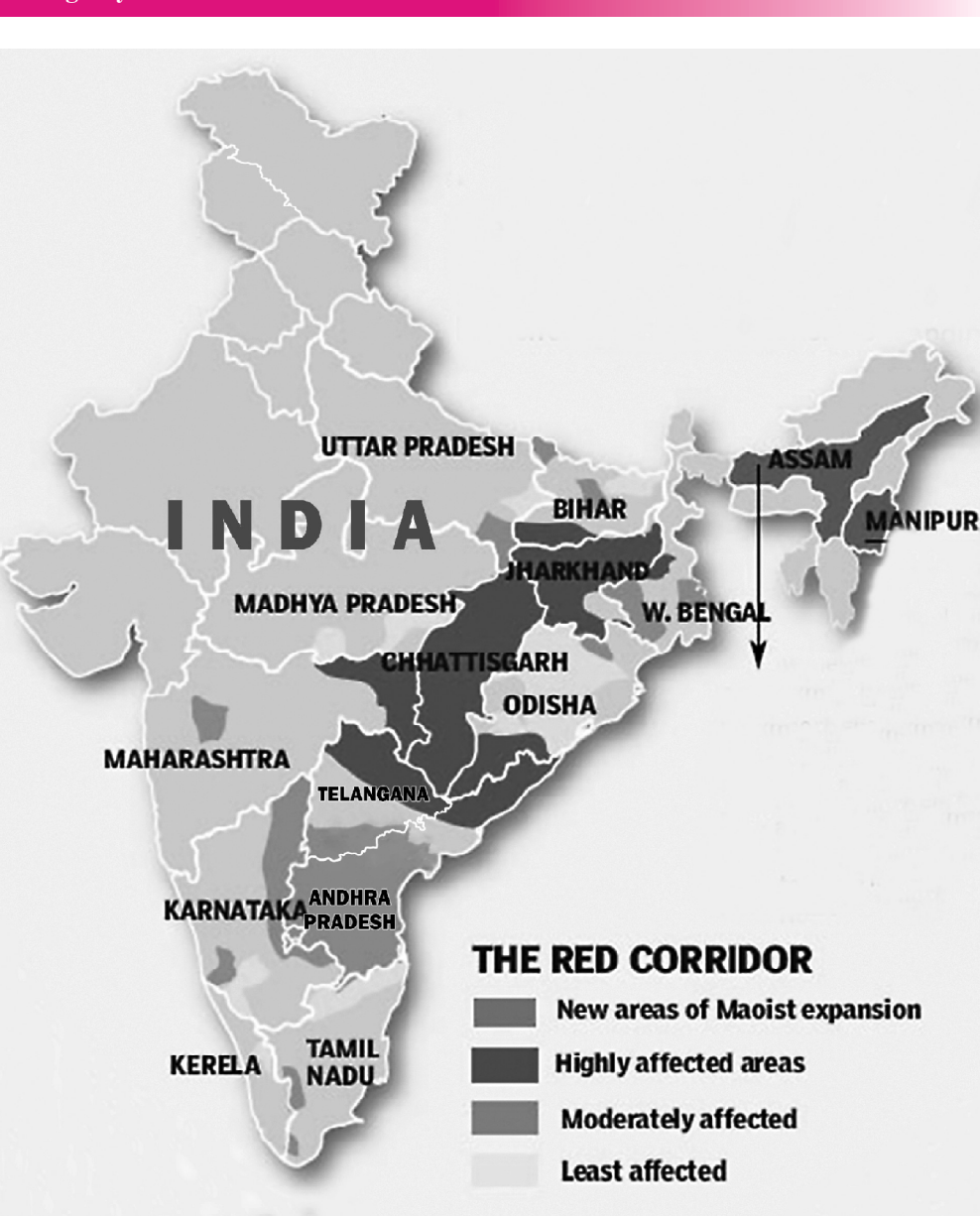
Map 21.5 : Areas affected by Maoist and Naxalites