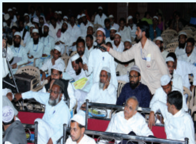
Advocacy Programme in Session

About 250 participants from all over Maharashtra namely from Jalgaon, Ahmednagar, Nagpur, Nashik, Aurangabad, Pune, Solapur, Beed, Latur, Nanded,