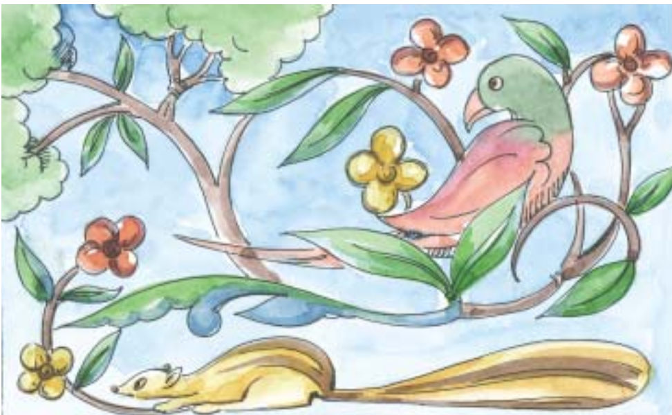
Fig. no. 15