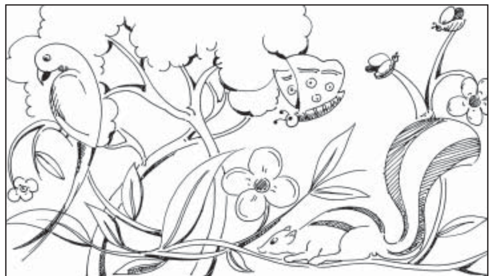
Fig. no. 13