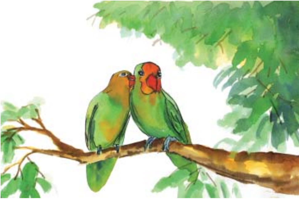
Fig. no. 6