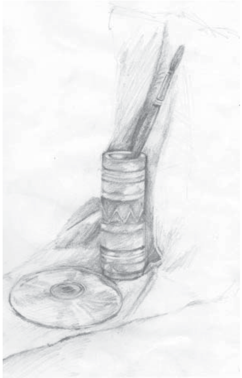
Fig. no. 7

Select a few of these and set on an even platform. Hang a curtain in the background. Choose the items according to the choice of the object. It is presumed that the student is wise enough to decide the size of the object. Firstly, draw one or two object with pencil and show light and shade. (See Fig. No. 7). Use of colour should follow it. Balance, harmony and rhythm are essential for composition. (See Fig. No. 8). You can select some vigitables and arrange on a table with a coloured cloth in the back ground. Draw and colour it (see Fig. No. 9).