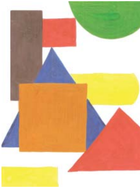
Fig. no. 4