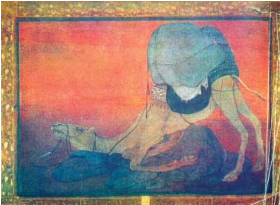
END OF JOURNEY By Abanindranath Tagore (Wash Painting)