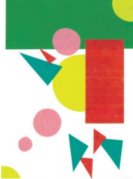
Fig. no. 3