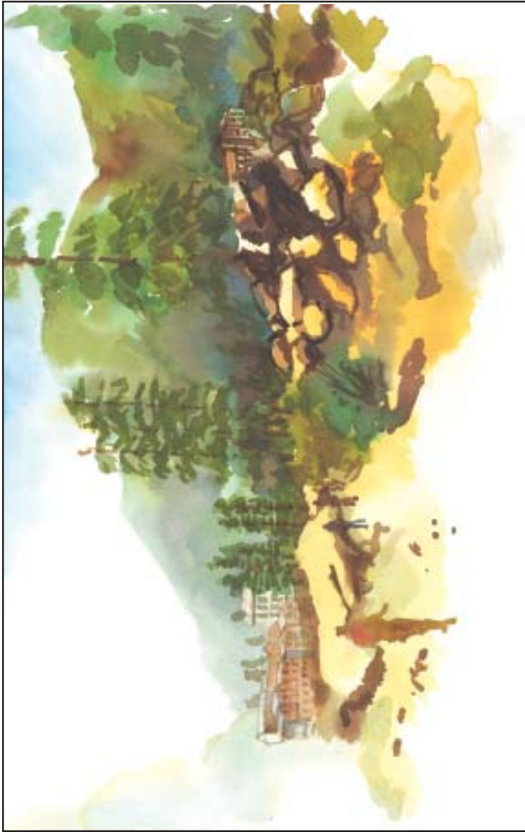
Fig. no. 11

Now colours can be used in the composition. Decide and mark the spaces for high, medium and low tone of colours. Balance of colours is essential. Harmony and rhythm are the signs of good composition. See Fig. No. 11.