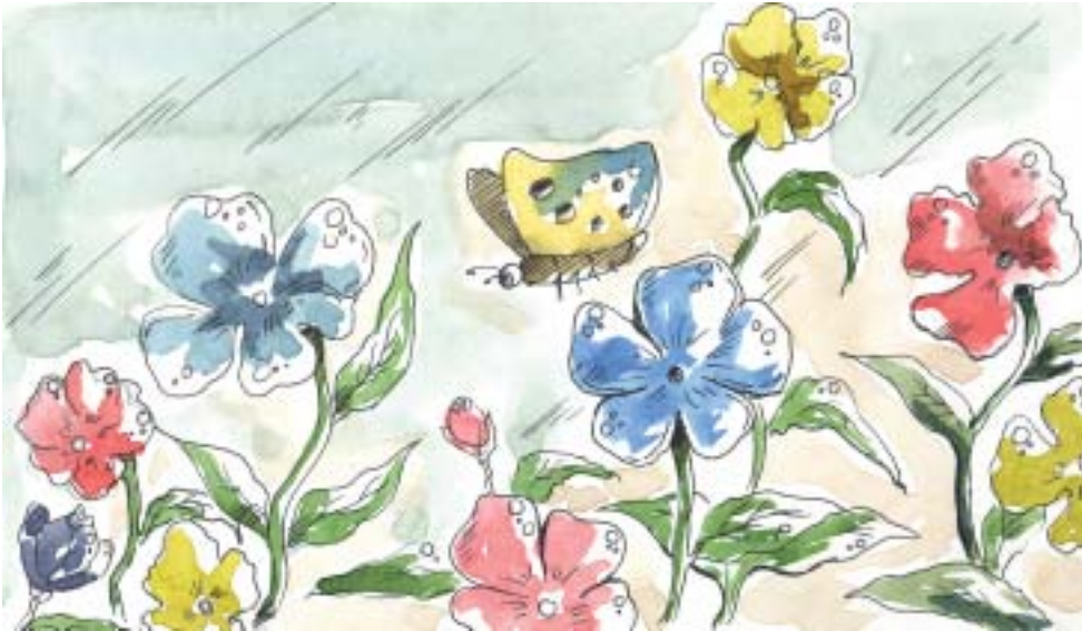
Fig. no. 14