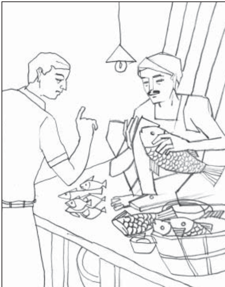
Fig. no. 17