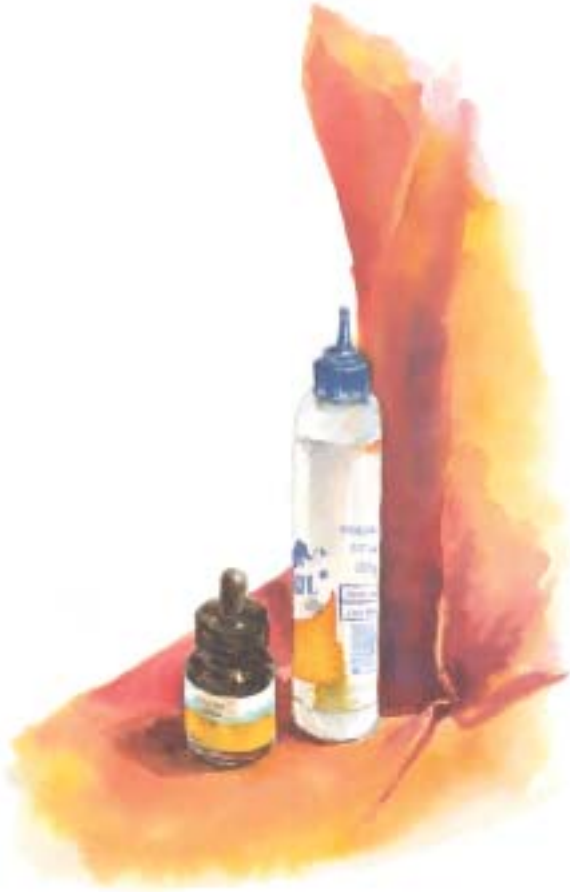
Fig. no. 8