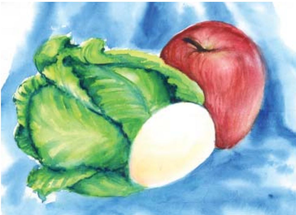
Fig. no. 9