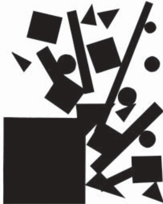
Fig. no. 2