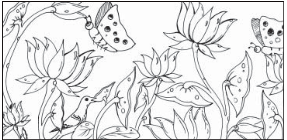
Fig. no. 12