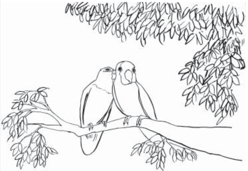
Fig. no. 5

Composition may be vertical or horizontal. It depends on the artist's choice. It is important to note that all components used in the composition are related to each other. It is also important to note that withdrawal of any component would affect the entire composition. Every composition has a central focal point. It should be an obvious point in the entire composition. Every good composition has balance, harmony and rhythm. See Fig. No. 5 and 6. Two birds are composed on a tree branch with harmony and balance. After line drawings, the composition is coloured. Such a combination would make the composition attractive and complete.