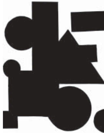
Fig. no. 1

Remember, the composition should be harmonious and balanced irrespective of the medium you use. It may be water colour or poster colours (see fig. nos. 1, 2, 3 and 4).