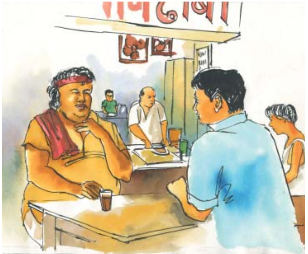
Fig. no. 16

In Water-colour technique, begin with-light colour and then use dark tones. Apply out-two layers of light colours and then apply medium and dark colours. This will make the colours evident. Shadow can also be shown in this type of colour combination (see fig. no. 16).