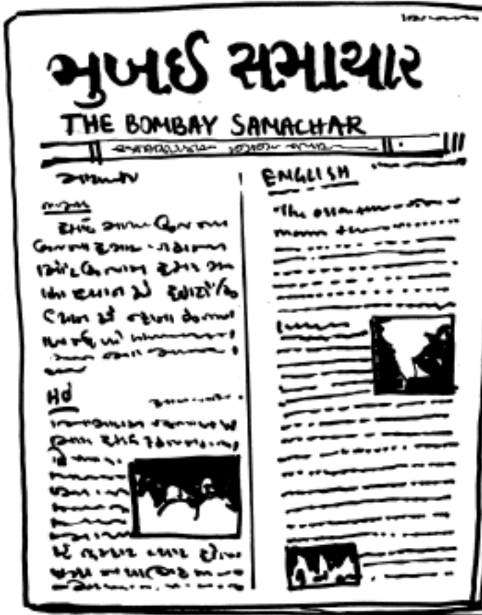
Fig 5.8: Mumbai Samachar

The Gujarati daily "Mumbai Samachar" published from Mumbai is the oldest existing newspaper not only in India but also in Asia. It was established in 1822.