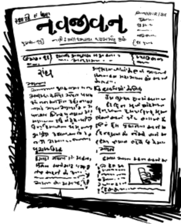
Fig 5.11: Navjeevan

Can you guess how many newspapers in India have crossed 100 years of publication and are still in circulation? There are 41 such newspapers in the country and are called centenarian newspapers. Among English dailies, four have crossed this mark: The Times of India, The Hindu, The Tribune and The Statesman. Among language newspapers, Mumbai Samachar, Amrita Bazar Patrika, Malayala Manorama and Deepika are among the centenarians.