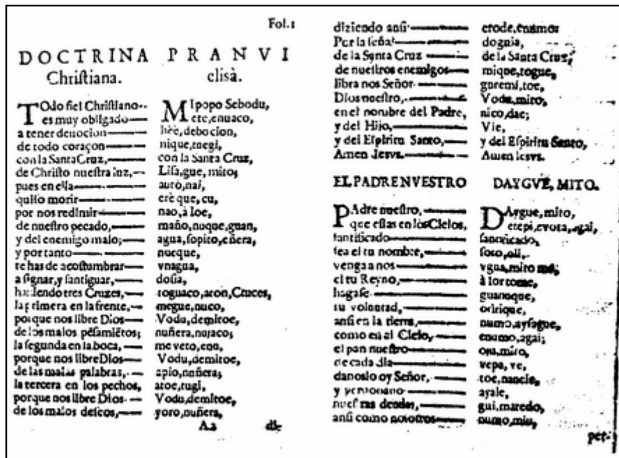
Fig 5.6: Doctrina Christa

The invention of printing has revolutionised mass communication. Books are printed in large numbers and circulated in many countries. No other invention has had such an influence in the history of mankind.