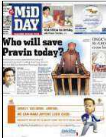
Fig 5.14: Tabloid

Berliners or Midis are very small newspapers. European papers such as La Monde and La Stampa are Midis. “Mint” is the name of a Berliner published in India. In India, some magazines print special booklets in this format.