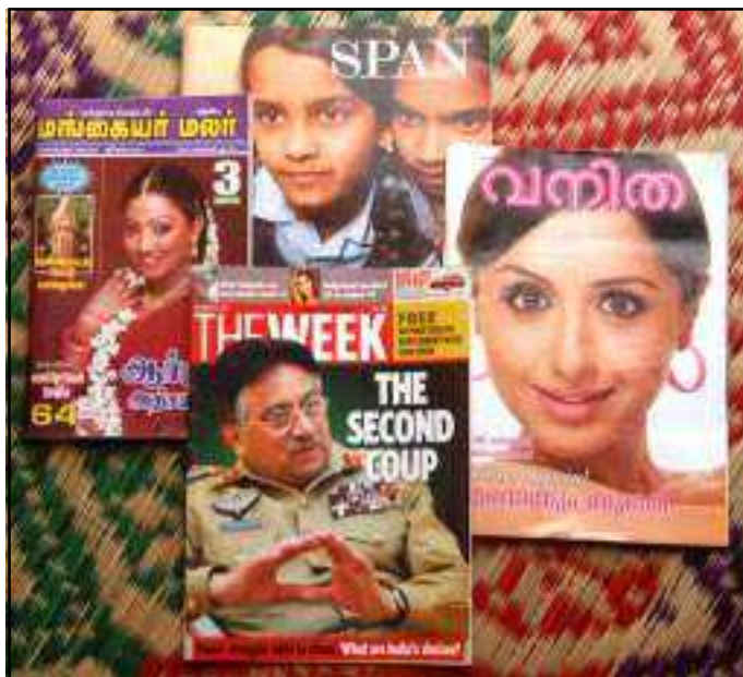
Fig 5.15: Magazines

“India Today” is a weekly, while “Chompak” is a fortnightly. “Grihasobha” and “Vanitha” are monthlies.