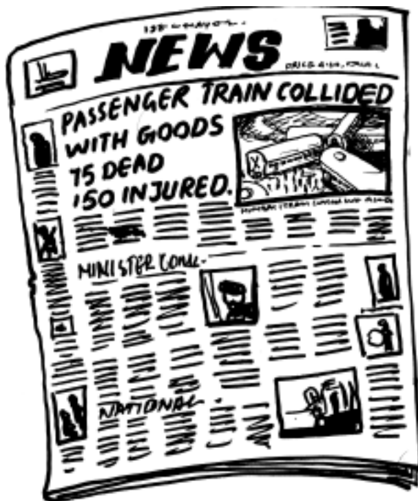
Fig 5.1: News of a rail accident

Ramu and Ravi were planning to go for a movie. Both got pocket money from their parents and permission to go for a film. Ramu asked Ravi whether he knows the names of films playing in different theatres in the City. Ravi was also not sure about it. So they picked up a newspaper. The paper gave all the details about films shown in different cinema halls in the city.