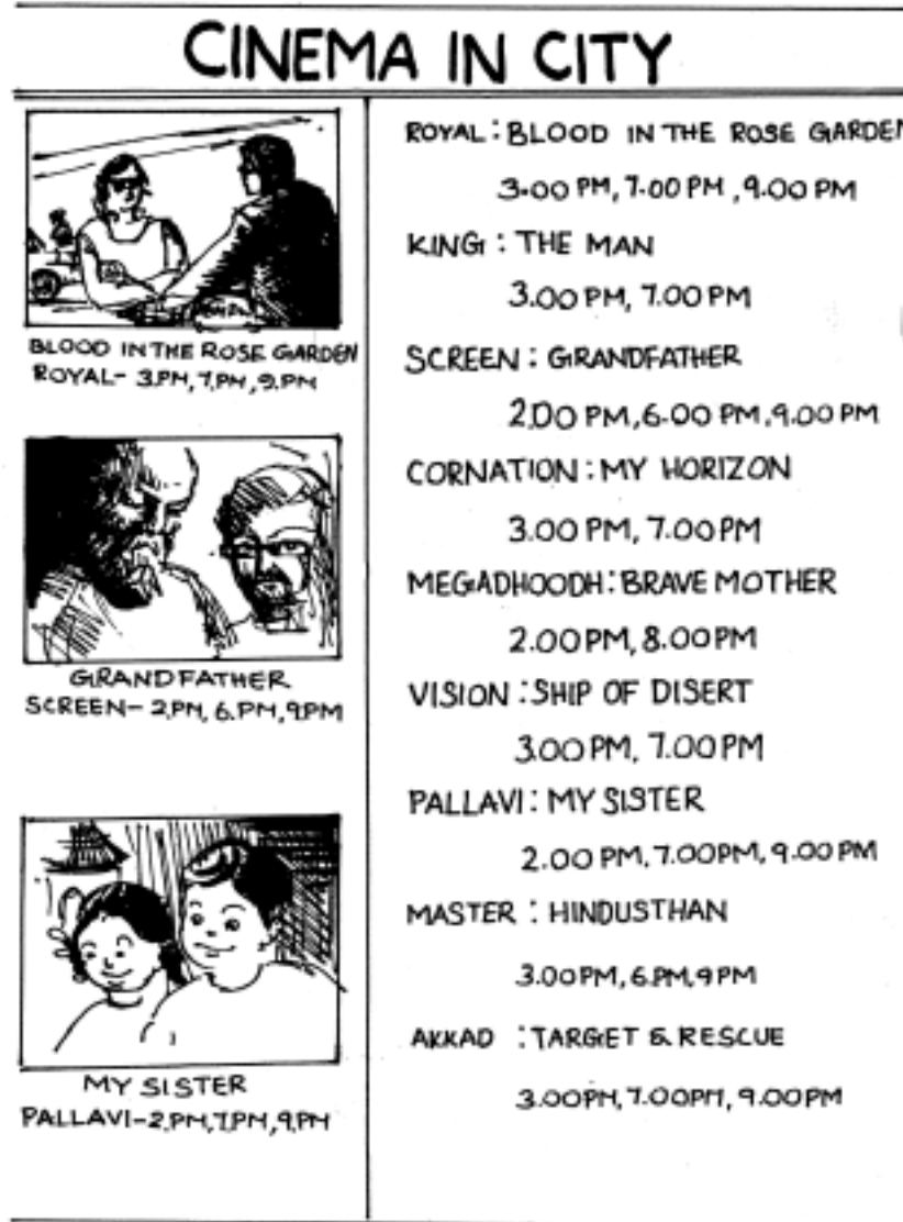
Fig 5.2: Cinema theatre list

You must have seen such columns in the newspaper. They appear under the title 'entertainment'. So you look into the newspaper for entertainment also.