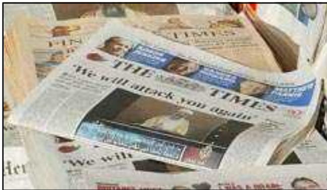
Fig 5.13: Broadsheet

Morning newspapers are generally broadsheets. They are big in size. In India, all major newspapers are broadsheets. Examples include “The Times of India” and “Hindustan Times”. Tabloids are only half the size of broadsheets. In India most of the evening papers are tabloids. Examples are “Mid-day” and “Metro Now”. Presently some of the new morning papers have also adopted the tabloid format.