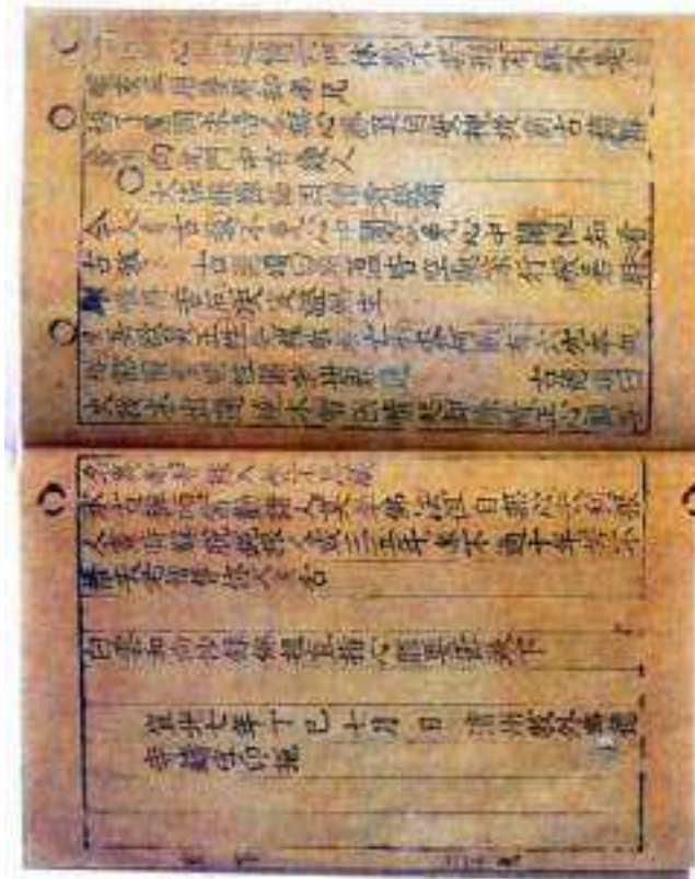
Fig 5.5: Buddhist Text of 1377

The first printed book published in China was the Buddhist text, the “Diamond Sutra” by Wang Chik in 868 AD. Some copies of the Buddhist scriptures printed in 1377 are preserved in museums in China.