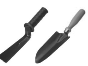
Fig. 7.1: Khurpi or weed scrapper