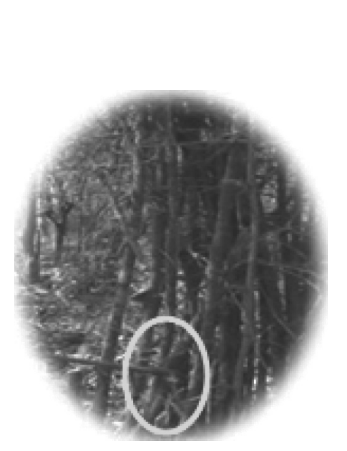
Fig. 7.4: Cutting bamboo at 2<sup>nd</sup> node from bottom