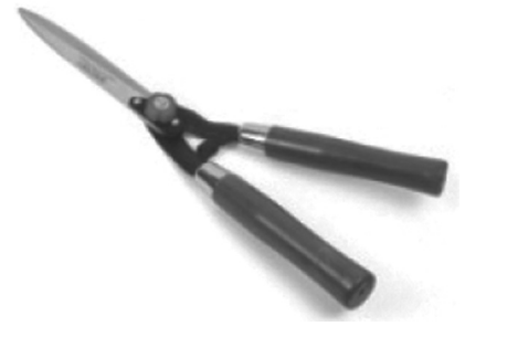
Fig. 7.2: Pruning shears